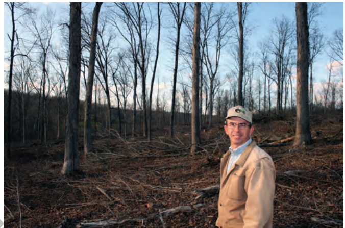
Figure 1. Becoming familiar with timber marketing and harvesting operations will assure you that the operations are proceeding according to your expectations.

Written by H.E. "Hank" Stelzer , Forestry State Specialist, School of Natural Resources