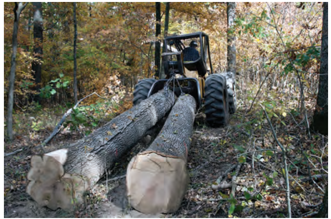
Figure 3. Visit the harvest area frequently to ensure the terms of the contract are being fulfilled and to increase your knowledge of harvest operations.

You should request that you and/or your forester be present the day harvesting begins. By being there, you and/or your forester will have the opportunity to discuss the operation with the buyer or the buyer's representative on