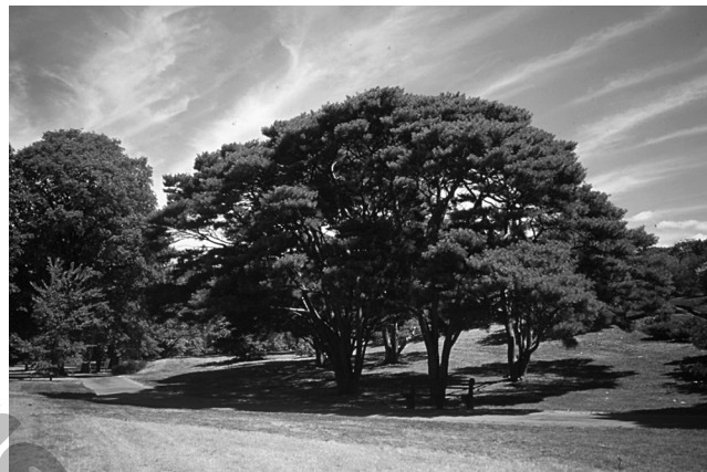
Figure 1. The open, horizontal branching of the Japanese red pine makes it an interesting tree for specimen planting.

The approximate mature height is given with each listing, although in some cases plants of these less common types are slow growing and may have their maximum use at much smaller sizes. The plant hardiness zone or zone range also is included, since some of these plants need protected locations or special attention in colder areas, or are not hardy throughout the