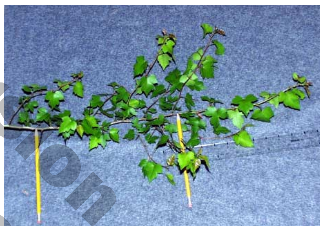
Figure 2. Twig growth on a young tree should be 9 to 12 inches per year. The space between the first two bud scale scars (indicated here by the pencils) is last year's growth.

12 inches or more per year (Figure 2). Large, mature trees may grow only 4 to 6 inches per year.