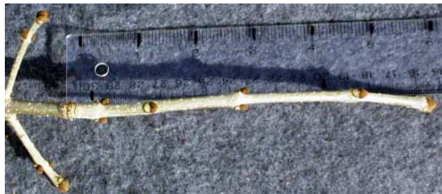
Figure 1. Gauge a tree's growth in the current year by the distance between the tip of a twig and the first bud scale scar.

Determine general tree vigor by checking the growth of several twigs during the past three or four years. Twig growth on most young trees should be 9 to