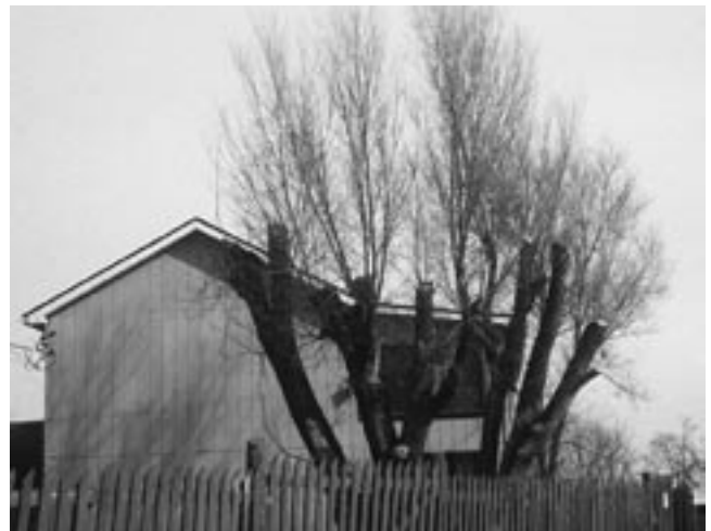
Figure 4. Topping hurts the appearance of a tree for several years and increases its vulnerability to disease, insects and storms.

Large old trees are subject to sunscald if they are heavily top-pruned. The bark may be killed when it is suddenly exposed to full sunlight. To prevent sunscald, prune only part of the tree top in any one year. If it is necessary to remove a large limb, the trunk may be protected against sunscald by painting it with light colored water-base paint. Oil-base paints may damage the bark.