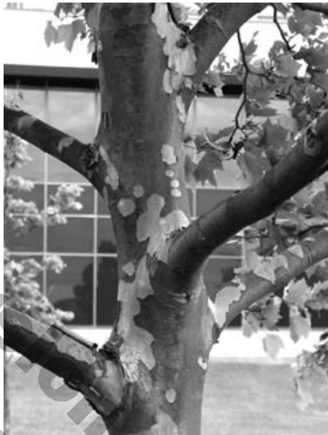
Figure 1. Scaffold branches should have good vertical as well as radial spacing.

One or two years after planting, start pruning the tree to improve its form. Select the main (scaffold) branches at this time. They should be well spaced along the main stem, smaller in diameter than the