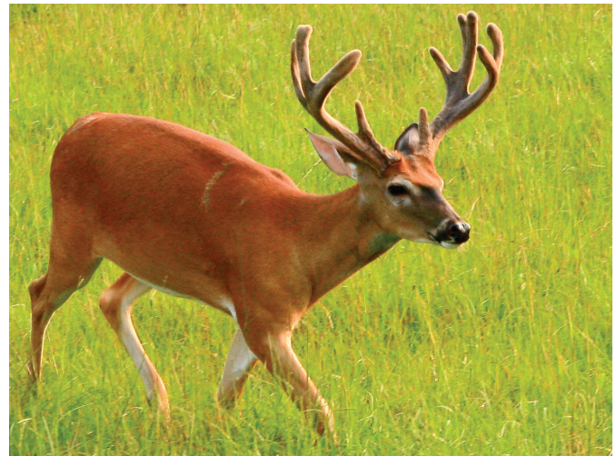
Figure 3. Male deer require more protein in their diet during antler development.

Nutrients support an animal’s physiological needs. The nutritional requirements of white-tailed deer are relatively similar throughout the deer’s range; however, they change seasonally, as does the nutritional content of the vegetation. These requirements include protein, energy, minerals, vitamins and water.