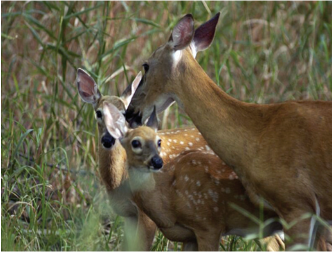
Figure 4. Female deer require more protein in their diet during the spring to support pregnancy and lactation. Those that bear twin fawns require even greater amounts of protein.

protein diet for maintenance (not including reproduction and antler growth). During the winter, deer do not require large quantities of protein. In the spring and summer, however, protein requirements increase for both males and females.