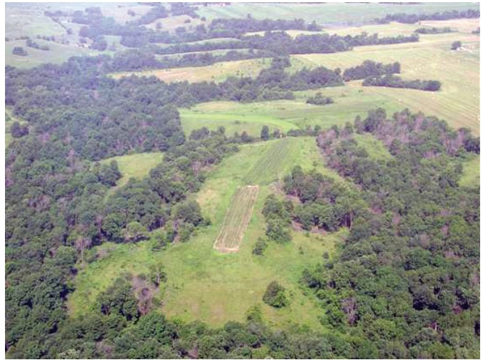
Figure 7. Managing for a diversity of vegetation throughout the year provides deer with high-quality food sources and adequate nutrition. In this example, the landowner has implemented timber stand improvements; managed old fields, pastures and hay fields; and established food plots to achieve management goals and objectives.

In rural areas, deer hunting is the primary method for regulating populations. Once an acceptable population density is achieved, habitat management practices can be implemented to enhance the availability of food and cover. Maintaining deer populations at a specific level requires herd monitoring. Refer to MU Extension publications G9481, G9482 and G9483 for more information on the collection of camera, harvest and observational information as a basis for deer population management.