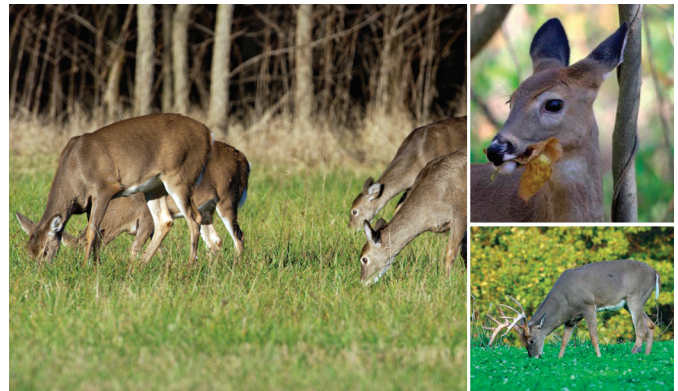
Figure 1. The nutritional quality of vegetation is an important factor in ensuring a healthy deer population.