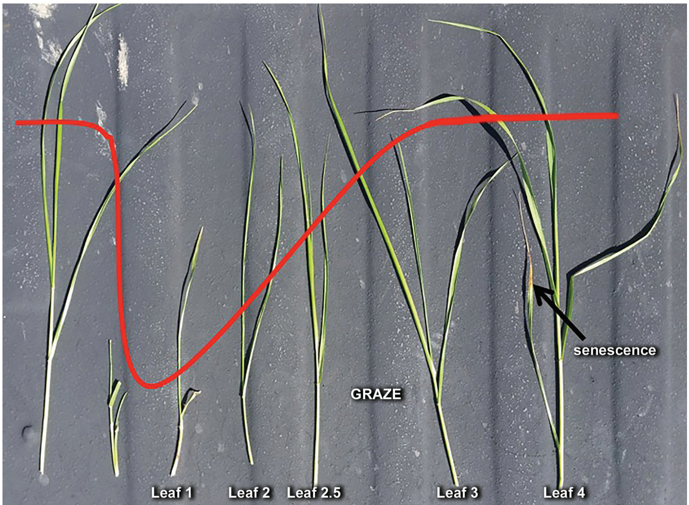
Figure 1. Leaf stage and water-soluble carbohydrate levels (indicated by red line).

forage mass and average growth rate. (The Determining Pasture Yield publication listed under Additional resources describes two rapid methods of estimating dry matter in a paddock.)