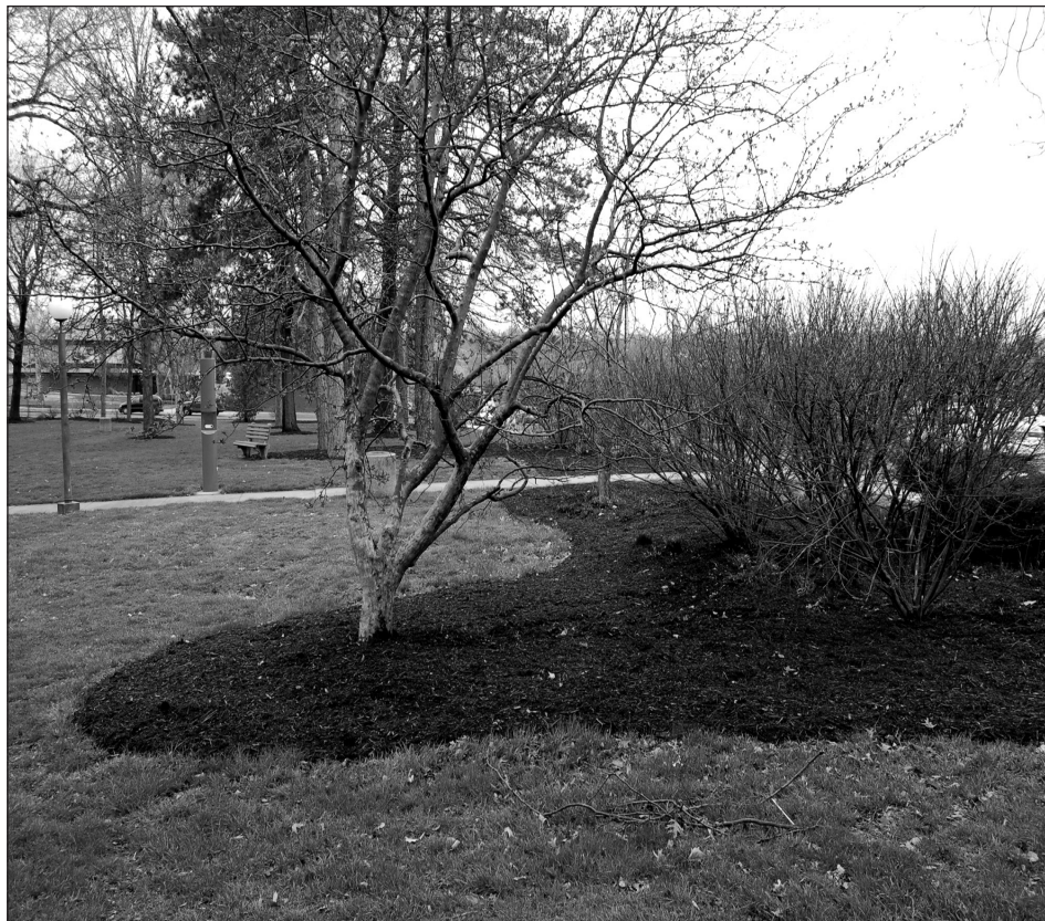
Figure 2. Idea for landscape plantings. Consider planting groups of trees and shrubs in large, mulched planting beds. Such groupings can be attractive and simulate natural conditions.

Many large-balled and burlapped trees are sold with wire baskets securing their root balls. There is debate about whether the wire should be removed at planting. Based on the limited research available, most tree-care professionals recommend removing the top ring of wire. This wire can be removed after the root ball is placed in the planting hole. Because most of the roots of a tree are found within a foot of the soil surface, they tend to grow over the wire. Attempting to remove the entire basket may destroy the root ball.