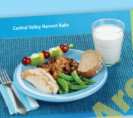
Central Valley Harvest Bake