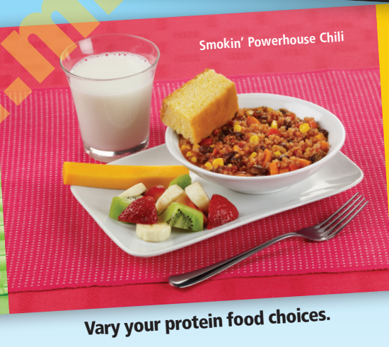
Smokin' Powerhouse Chili