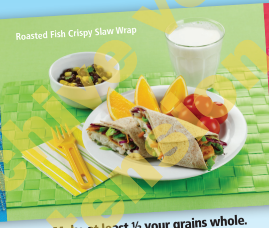
Roasted Fish Crispy Slaw Wrap