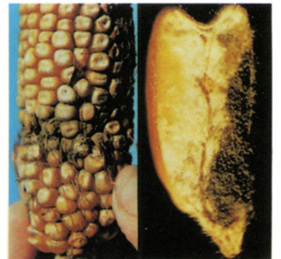
14. Aspergillus ear rot and storage mold