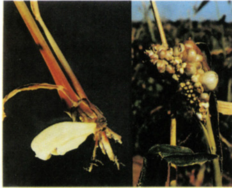
2. Common smut