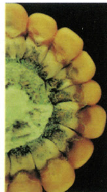
13. Nigrospora ear rot