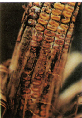
11. Gibberella ear rot