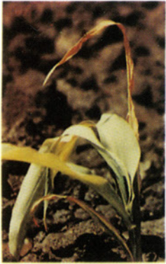
1. Seedling blight