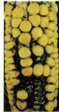
9. Trichoderma ear rot