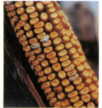
10. Fusarium kernel or ear rot