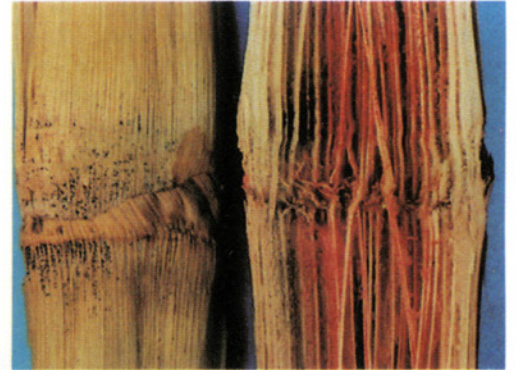
6. Gibberella stalk rot