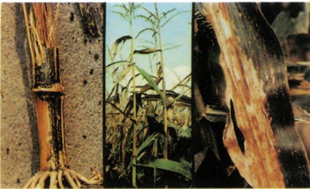
7. Anthracnose. L, stalk rot; C, top-dieback; R, leaf blight