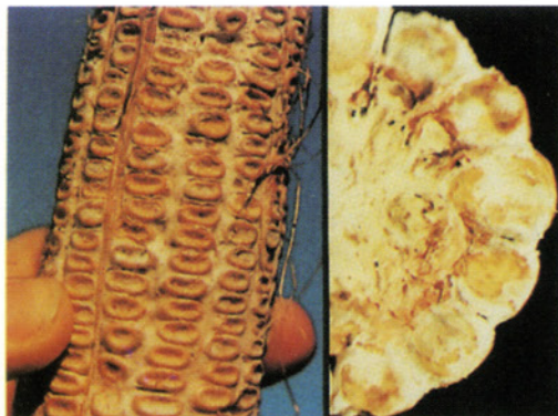
12. Diplodia ear rot