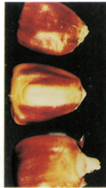
8. Kernel red streak