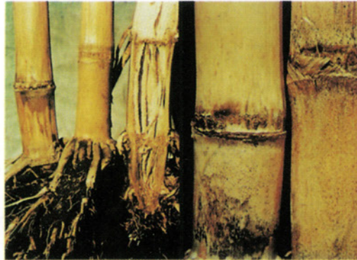
5. Diplodia stalk rot