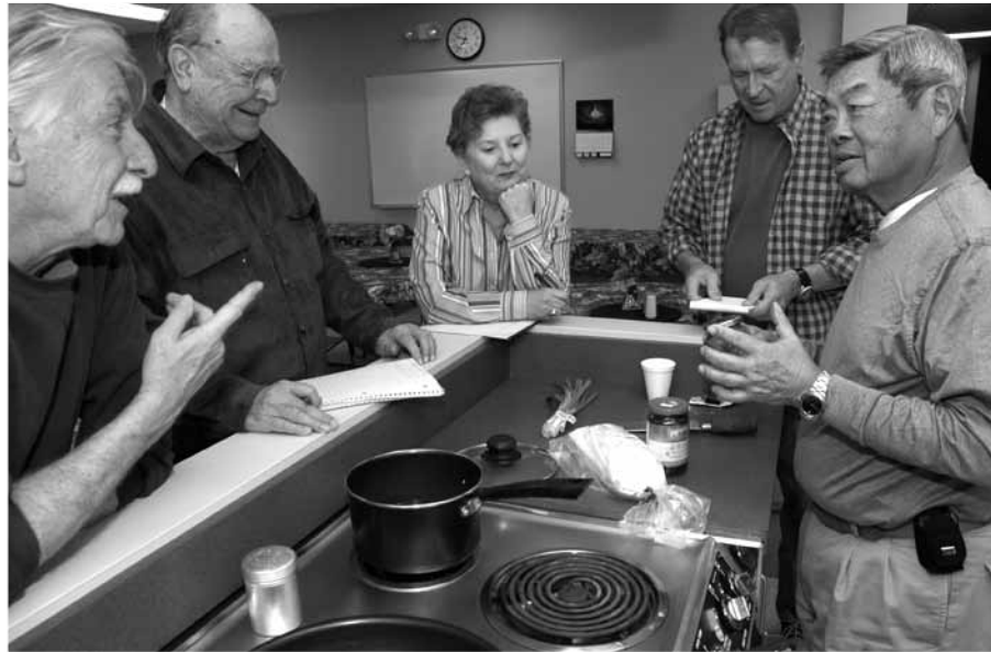
Chinese Cuisine — With a Midwestern Twist was just one of more than 60 wide-ranging courses that encompassed both practical skills and intellectual enrichment for "seasoned" adult learners enrolled at the Osher Lifelong Learning Institute during FY 2010.

As the first program of its kind based at a Missouri higher education institution, the institute continues to serve as an unmatched resource for the state's older adult populations, whether they reside in Columbia or rural communities around the state served by interactive television.