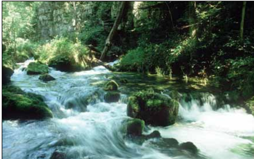
Greer Spring in Oregon County is Missouri's second largest spring. The powerful spring flows through a beautiful wilderness into the Eleven Point River.

The South Central Region encompasses 16 Missouri counties — Camden, Crawford, Dent, Douglas, Gasconade, Howell, Laclede, Maries, Miller, Oregon, Ozark, Phelps, Pulaski, Shannon, Texas and Wright — three of which border Arkansas.