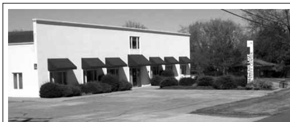
The Stephens Lake Activity Center — new home of Osher Lifelong Learning Institute classes.

Despite the economic downturn that continued in FY 2010, enrollments were stable in comparison to