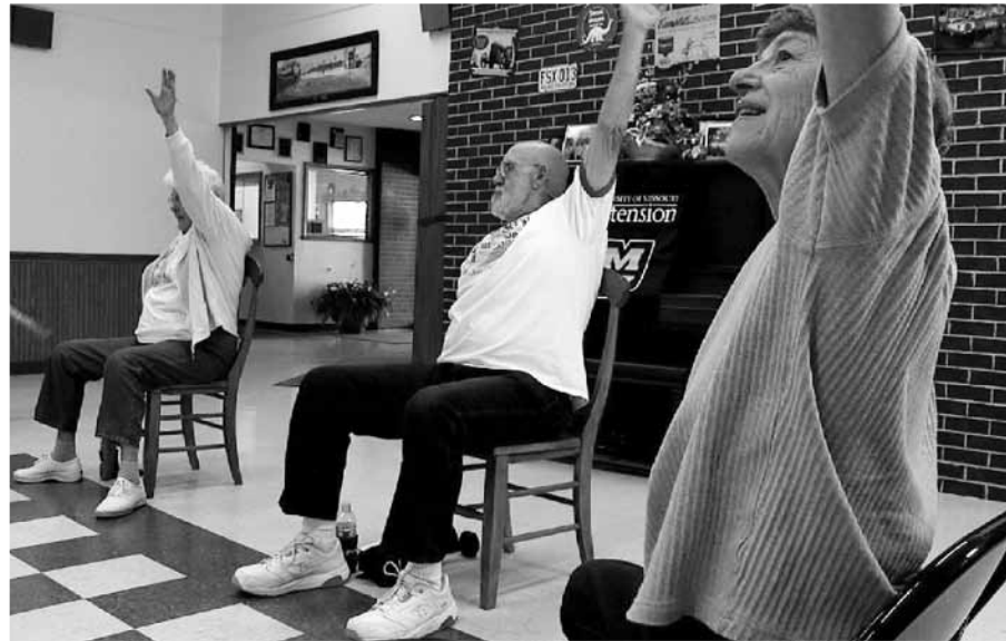
You are never too old to pump iron. The Advanced Stay Strong, Stay Healthy program uses weight training to challenge older adults. The 10-week MU Extension program, offered in urban and rural communities, allows seniors to get into a workout routine.

Human Environmental Sciences Extension provides Missourians with tools to build stronger futures and live healthier lives, including programs that develop financial education and family resources, promote healthy homes and workplaces, build individual nutrition and health, and increase physical activity.