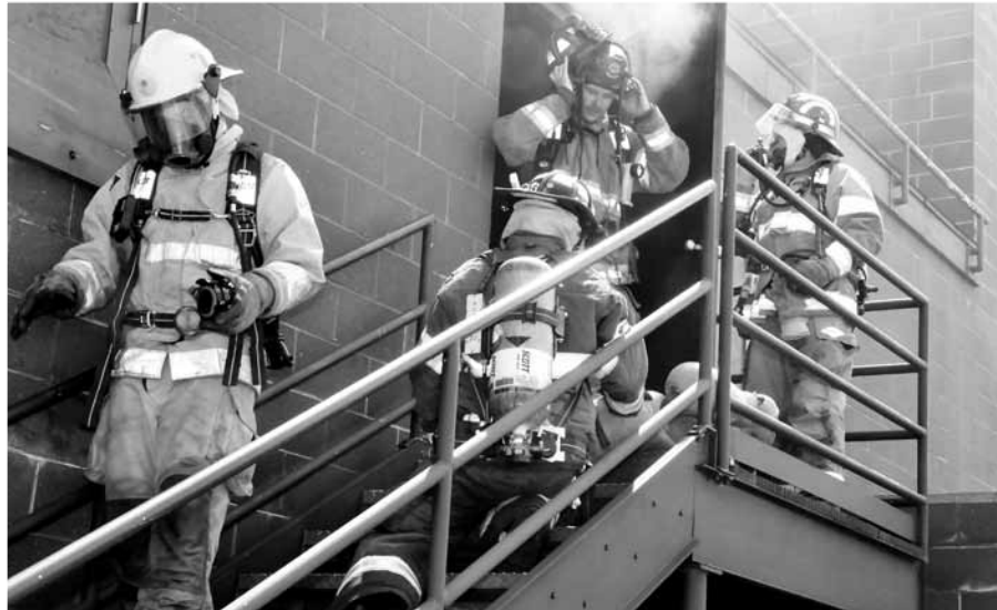
Personnel exit a training facility in Jefferson City where professional and volunteer firefighters ran live fire drills and honed other skills June 8-13 at the MU Fire and Rescue Training Institute's 78th annual Summer Fire School and Midwest Wildfire Training Academy. More than 700 emergency responders from 16 states used the event to sharpen and refresh their skills.

On average, the institute begins 14 courses each week at locations across the state. Last year, courses held in 85 Missouri counties drew participants from every county, 42 other states and two foreign countries.