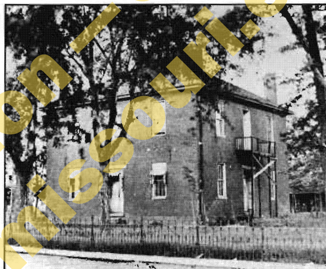
Fig. 1. Cass County Courthouse, 1843-1896.

An order issued by the court in May 1860 for building a new $15,000 courthouse caused concerned citi-