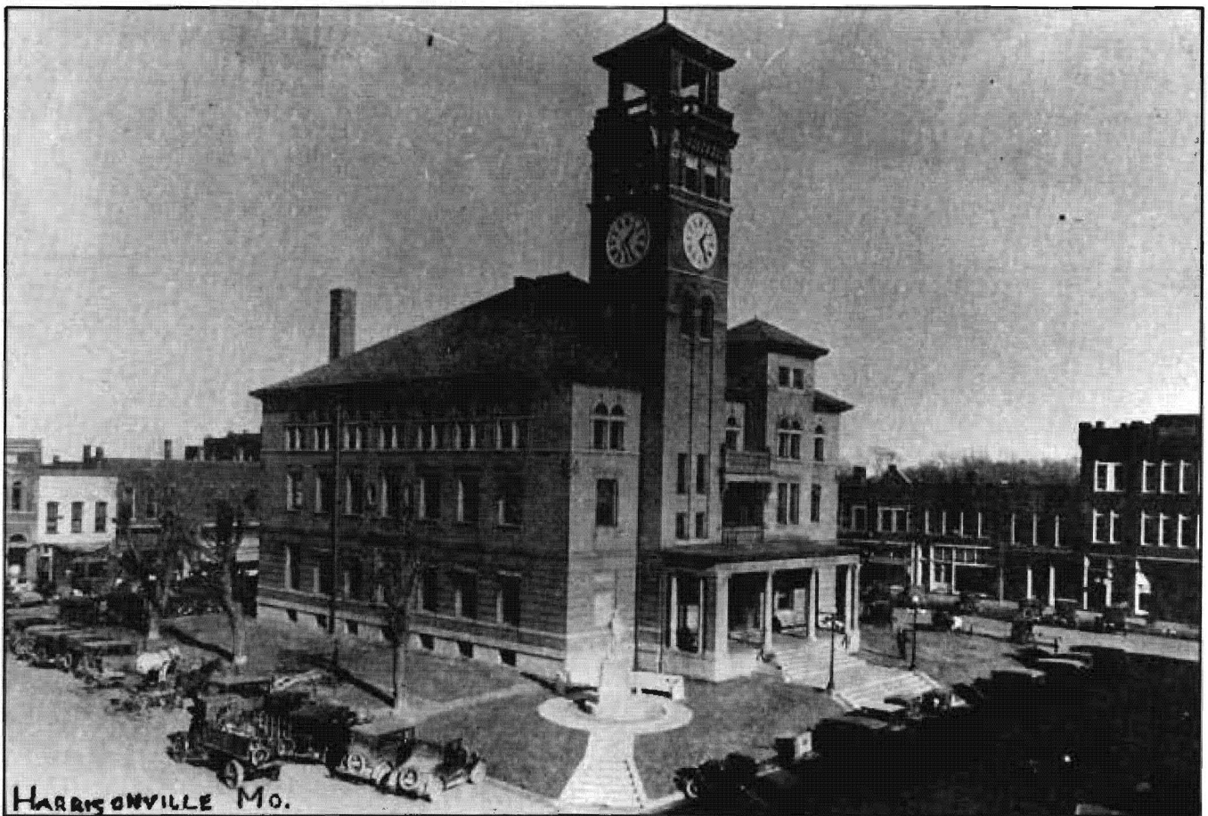
Fig. 2. Cass County Courthouse, 1897-. Architect: W.C. Root

for the building by direct taxation in two years, which they had authorized in an election March 14, 1896. W. B. Harrison superintended construction.