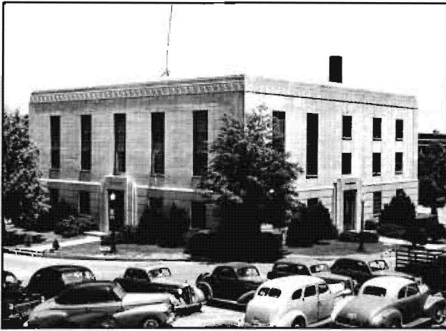
Fig. 2. Howell County Courthouse, 1935-. Architect: Earl Hawkins (From: West Plains Journal , June 17, 1937, courthouse dedication issue)

building, located south of the square, still stood in 1885 and was used as rental property.