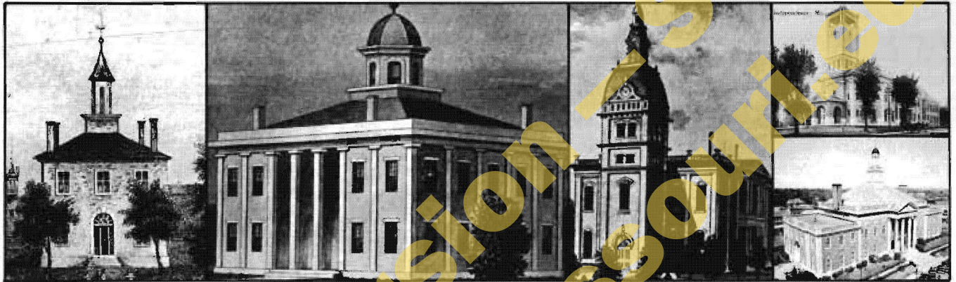
Figs. 1-5. Jackson County Courthouse, Independence. (Left to right) built in 1836. Remodeled in 1852; 1872; 1905 (above), architect: William E. Brown; and 1932 (below), architects: Keene and Simpson, D. F. Wallace, associate. (From: [Fig. 1] The United States Illustrated , ca. 1854; [Figs. 2, 3] Courthouses of Jackson County, Missouri , 1934; [Figs. 4, 5] postcards, Trenton Boyd collection)

Commissioners chose Independence for the name of the county seat of Jackson County in 1827. First courts met in private homes.