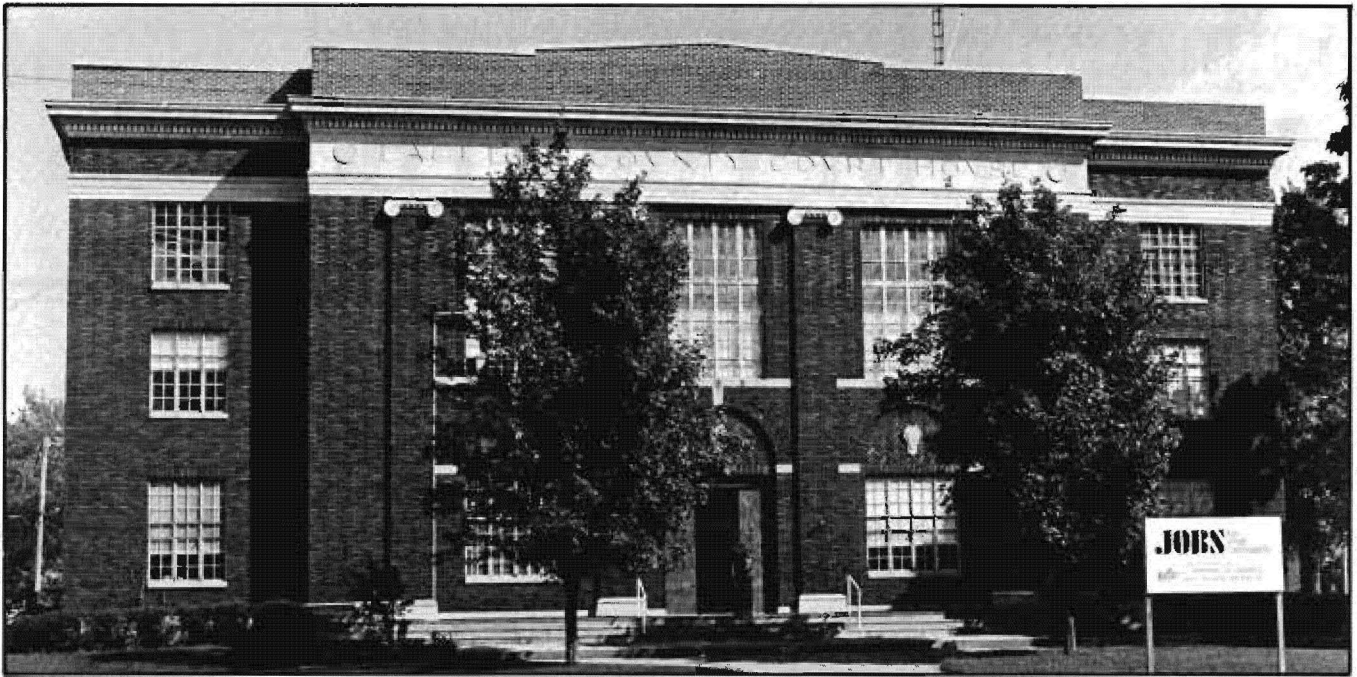
Fig. 2. Laclede County Courthouse, 1924-. Architect: Earl Hawkins

used this courthouse for almost 20 years.