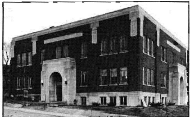
Fig. 3. Douglas County Courthouse, 1936. Architect: Dan R. Sanford

Contracts for building the new courthouse were awarded in December 1935 to Week's Construction Co., Kansas City. The red brick building is trimmed with "cast" stone, made with Carthage stone chips, crushed, mixed with cement, cast into blocks and polished to give the appearance of quarried stone (Fig. 3). Work began in March 1936, and county officials moved into the completed building in January 1937.