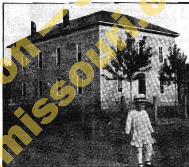
Fig. 1. Douglas County Courthouse, 1888-1937. (From: Douglas County Herald , March 26, 1976)

Retaliation came when citizens of Militia Springs (called Ava since 1881) built a $350 courthouse in 1872, retrieved the records and placed them in a log vault. Vandals burned the Militia Springs courthouse, destroying many records in July 1872, according to the Jefferson City People's Tribune . The paper's account carried a taste of cynicism: