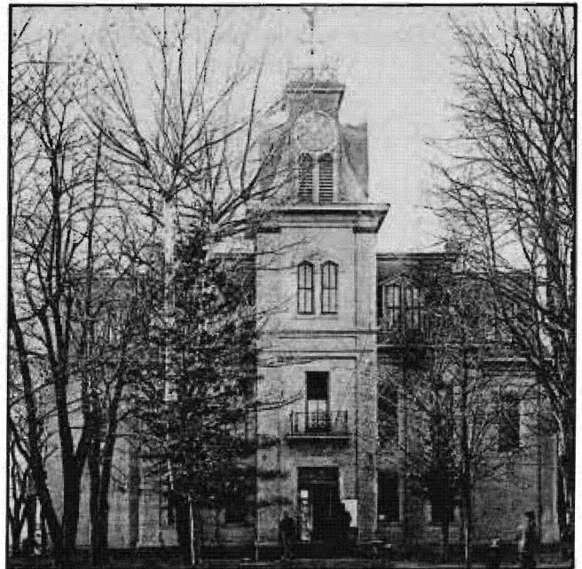
Fig. 2. Holt County Courthouse, after 1881 remodeling.

Some people questioned the legitimacy of the court's action, which took the county so far into debt. They were convinced that the court actually rebuilt under the guise of repair to avoid taking the issue before the county, since voter approval was not required for repair. Their protest resulted in a lawsuit that went to