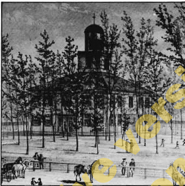
Fig. 1. Holt County Courthouse, 1850-1965. (From: An Illustrated Historical Atlas Map of Holt County, Missouri , 1877)