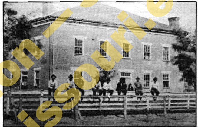
Fig. 1. Barry County Courthouse, 1855-1907, repaired in 1872.