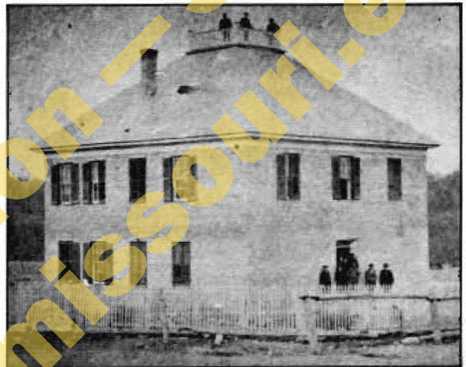
Fig. 1. Oregon County Courthouse, uncertain date.

Construction apparently was underway in October