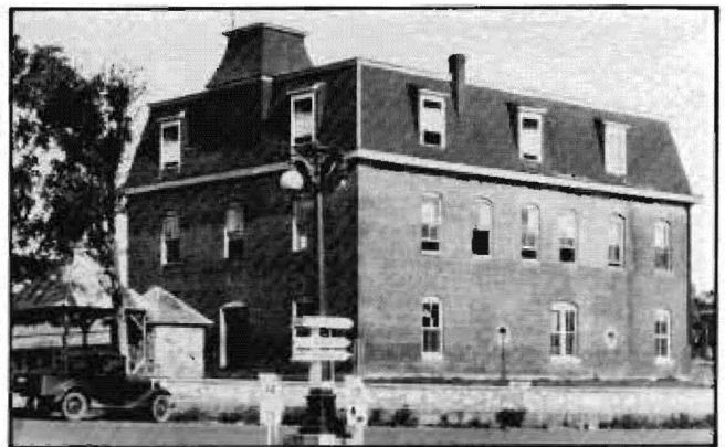
Fig. 2. Oregon County Courthouse, after 1903 remodeling.