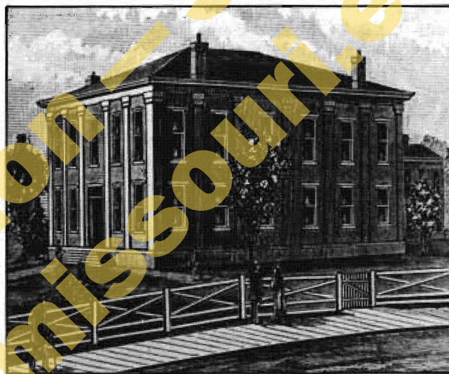
Fig. 1. Atchison County Courthouse, 1856-1880s. (From: History of Atchison County , 1882)