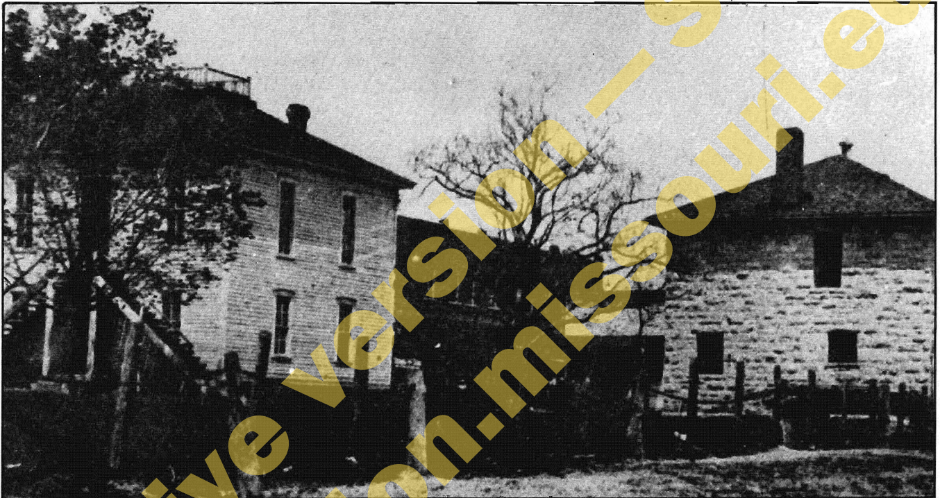
Fig. 1. Stone County Courthouse, 1870-1919, left. County jail, right.