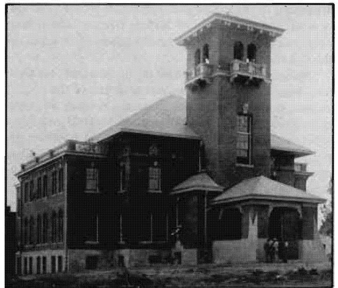
Fig. 3. Washington County Courthouse, 1907- Architect: Henry H. Hohenschild

Washington County's red brick courthouse, with a tall, square, bracketed tower rising from an entry porch, is comparable to neighboring Madison County's courthouse, 1899, designed by St. Louis architect Theodore C. Link.