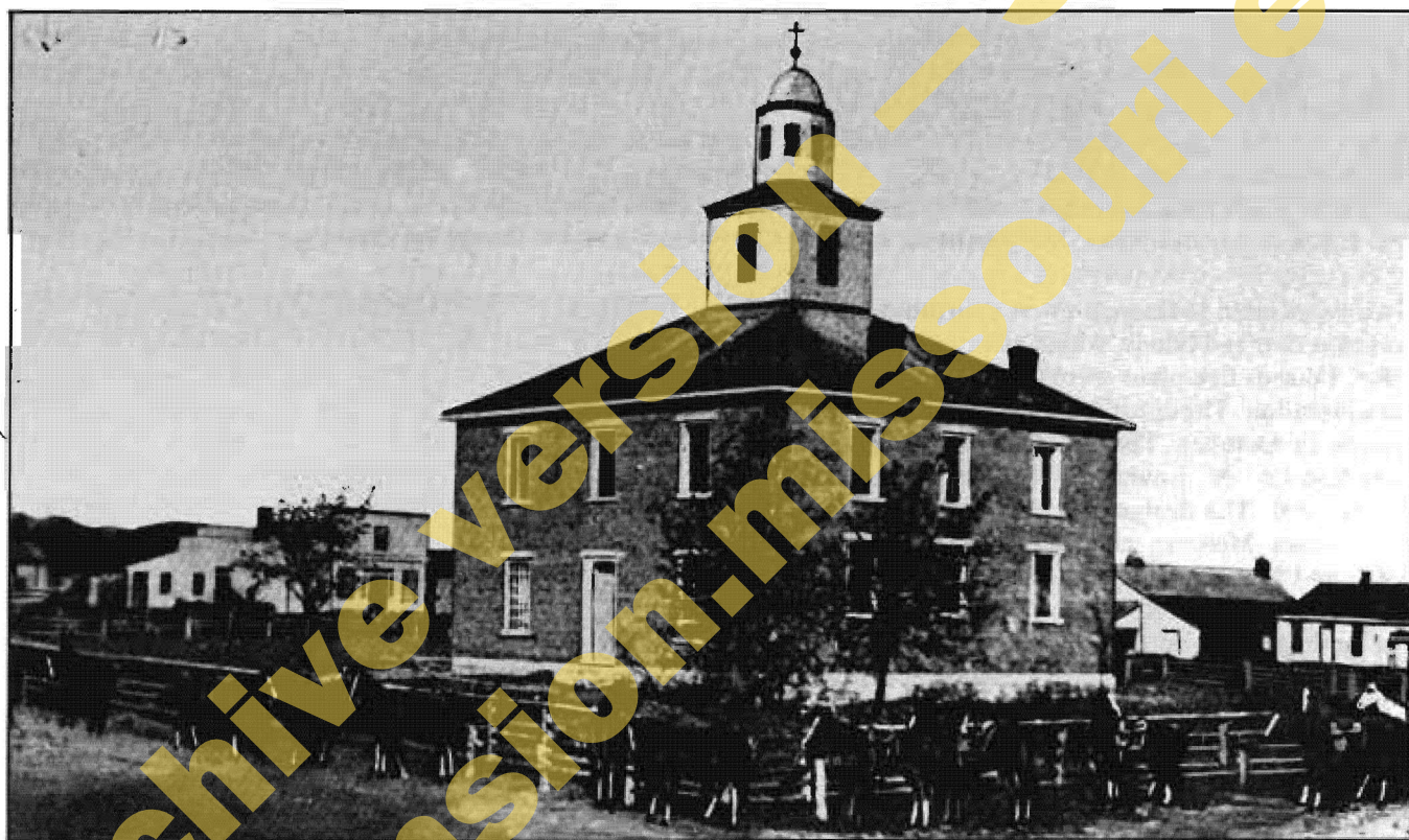
Fig. 1. Polk County Courthouse, 1841-1905.