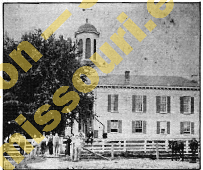
Fig. 1. Ralls County Courthouse, 1858. Designed by Henry C. Wellman, attorney.

The court first appropriated $8,000. Final costs amounted to about $18,000. The court awarded the building contract for $16,400 to Francis Kidwell, who then subcontracted. Three building superintendents were appointed; one resigned, and the court dismissed another. The court accepted the building in 1859 from