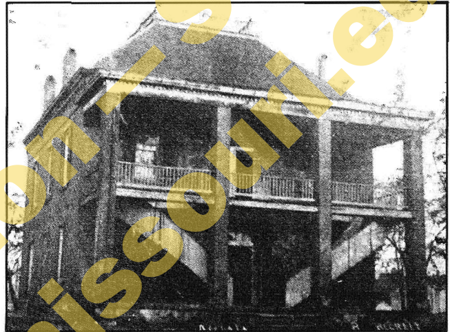
Fig. 1. St. Clair County Courthouse, 1866-1908. (From: Ozarks Mountaineer , October 1956)

A newspaper announcement calling for proposals for building the courthouse stated that the builder would be permitted to use the old bricks which were still on the site. Specifications called for the ground floor to be of brick laid in cement, as in the previous courthouse. The 44-foot-square structure was to be built upon the foundation of the previous building. Crossing halls were originally planned with exterior doors, but later windows were substituted. On the main facade, facing Second St., a porch had two stairways leading to the second story. Four two-story brick pillars supported the roofs covering the porches. Plans also called for a 16-foot shuttered cupola, which could be used as a bell tower. There was a five-foot cornice; caps and sills