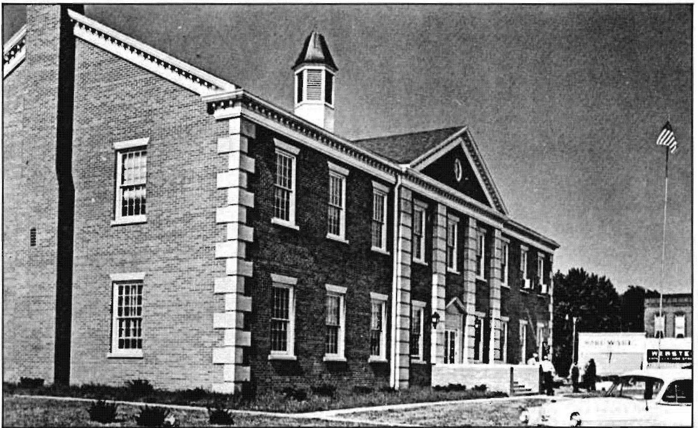
Fig. 3. Schuyler County Courthouse, 1960-. Architect: Kenneth O. von Achen and Associates

public subscriptions. The county and city shared use of the building (Fig. 2).