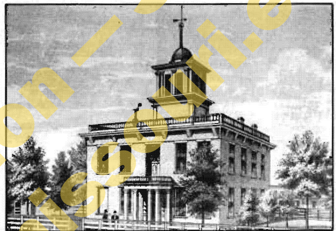
Fig. 1. Schuyler County Courthouse, 1856-1894.

Queen City wanted to become the county seat, but after a struggle, Lancaster retained the honor. For construction of their third courthouse, Lancaster contributed $7,500; the remainder of the funds came from