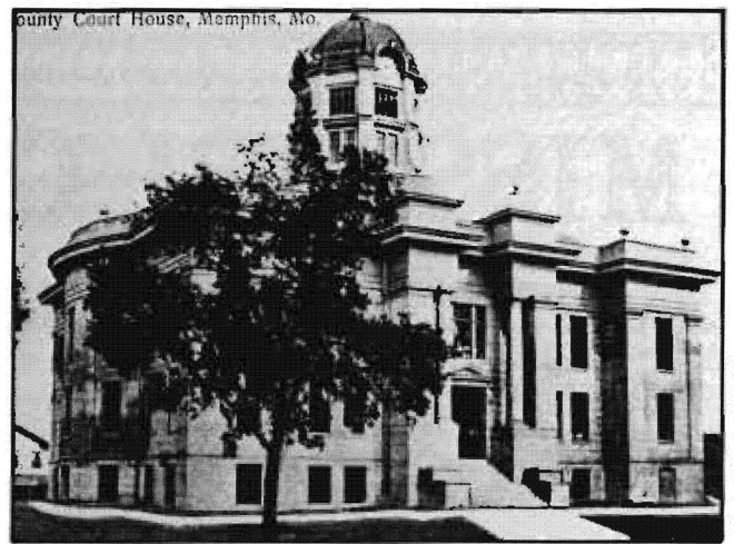
Fig. 2. Scotland County Courthouse, 1907- Architect: W. Chamberlain and Co.

The building measured 101 by 77 feet at the base, and 80 feet to the top of the dome. To cut some expense, the court simplified the architect's plan by eliminating a dome over the curved end and reducing the number of clock faces; the basement story was raised, thus providing more usable space. Some people expressed concern about the small size of the courtroom. The Memphis Reveille believed it was a mistake to have a courtroom that would seat only 300. The paper said every county