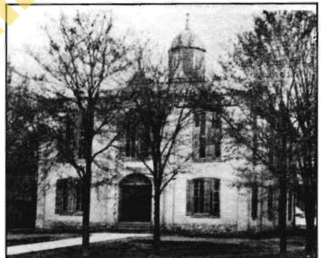
Fig. 2. Scott County Courthouse, 1883-1912. (From: Benton, Missouri Centennial 1860-1960 )