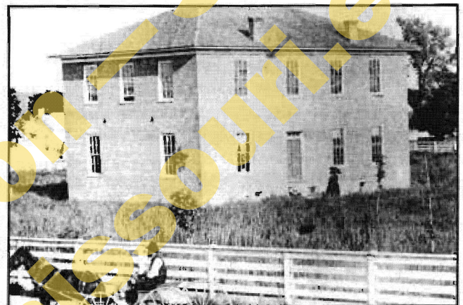
Fig. 1. Scott County Courthouse, 1864-1878, Photo ca. 1886. (From: Benton, Missouri Centennial, 1860-1960 )

The fifth courthouse, completed in 1883, was a brick, two-story building about 40 by 70 feet with a cupola (Fig. 2). The costs came to about $11,000. Thirty years later the community had outgrown the building. It was not well heated or lighted, and renovation would have been costly, so county officials decided to build a new one. The 1883 building was demolished in 1912, making way for the new and present courthouse.