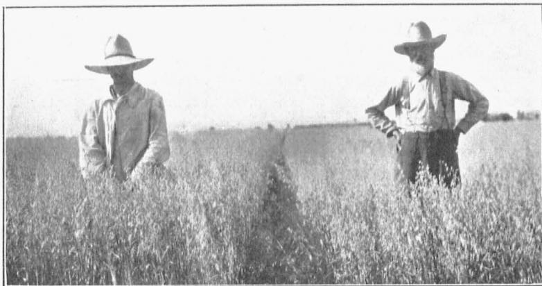
Fig. 3.—Oats at the left treated with 140 pounds per acre of 20 per cent superphosphate exceeded by 16\frac{1}{2} bushels per acre the untreated crop at the right. Over a long period similar treatment with fertilizer has increased the average yield by 6 to 8 bushels on this field.

The use of fertilizer with oats is not usually profitable if other practices in production are poor. But if such practices as the early sowing of a productive early variety, thorough preparation of the seedbed, and the treatment of the seed for smut, are all followed,