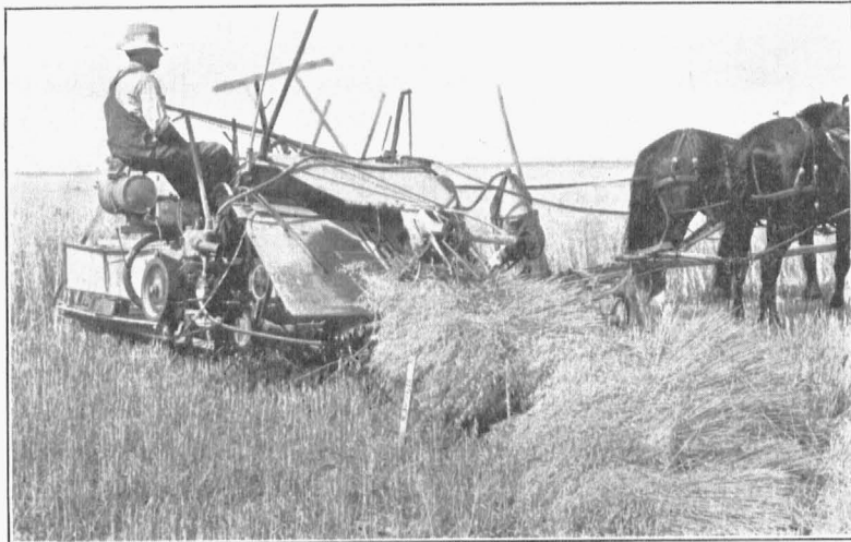
Fig. 2.—The 60-bushel crop of Fulghum oats shown here was grown on land scarcely medium in fertility. All good practices, including the early sowing of an early variety, were combined to produce this yield. The season was favorable.

The heavy reduction in yield from late planting in all three seasons—the excellent, the good, and the poor—indicates the necessity of starting the crop at an early date that will permit it to utilize the longest possible period of moist cool weather and thus reach an advanced stage of growth before it is damaged by drought and heat. If a late maturing variety, instead of the early maturing Columbia had been used in this test, the difference between the yields from early and late sowing probably would have been much greater.