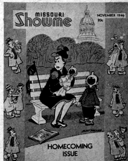
This Missouri Showme cover by Mort Walker was drawn 25 years ago. This Oct. 30, the Class of 1946 will return for its reunion.

Homecoming 1971 is a special reunion year for the classes of '26, '31, '36, '41, '46, '51, '56 and '61.