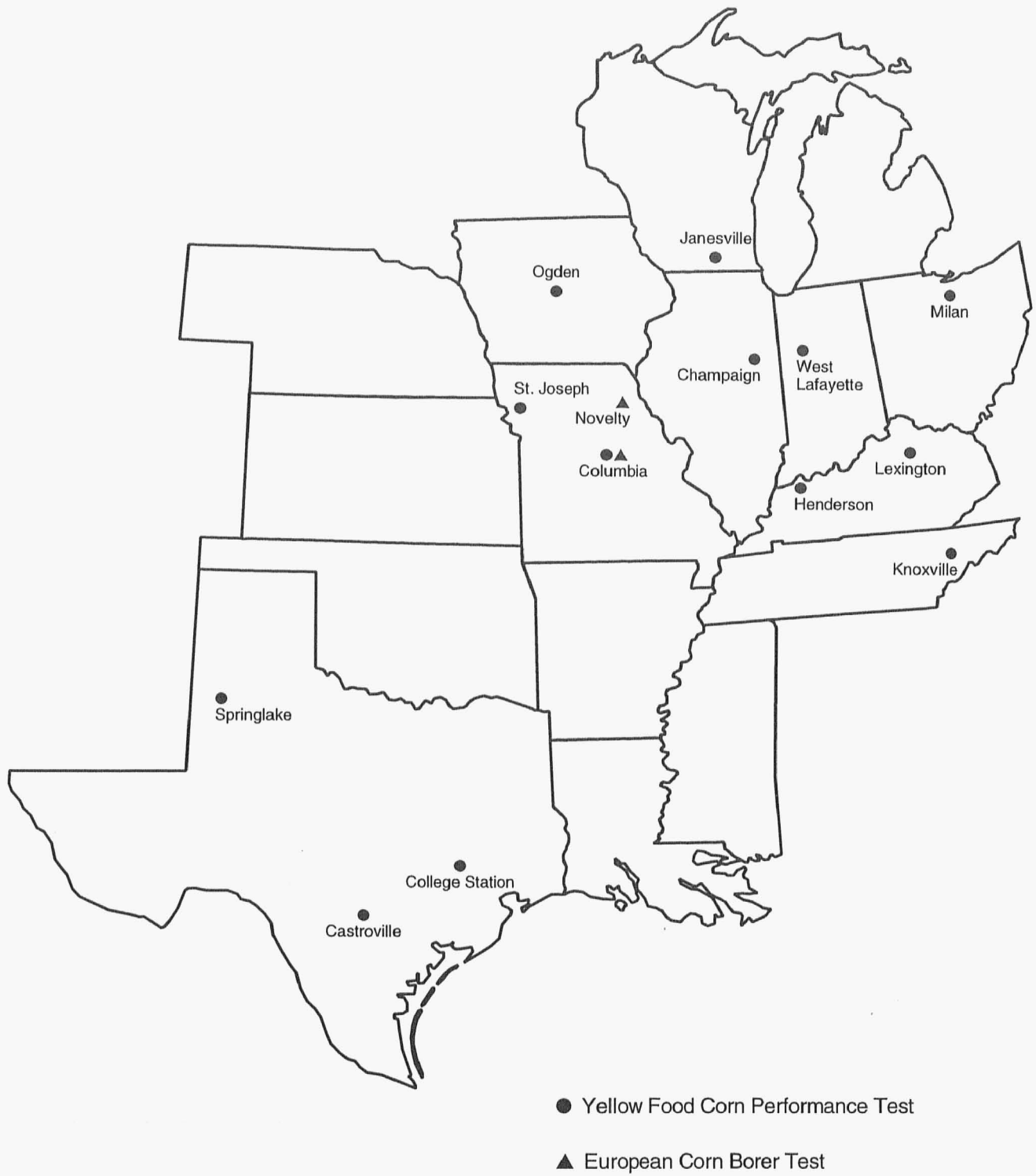
Fig. 1. Planted locations for the yellow food corn performance test.