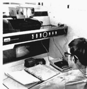
A student has access to various media options in the Self Instruction Center carrels.