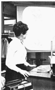
Students may use the overhead projector to view their work.