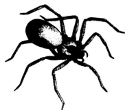
Brown recluse spider

What are those pests, and what should you do about them? Published in 1997 as a reference for commercial pesticide applicators, General Structural Pest Control is a densely