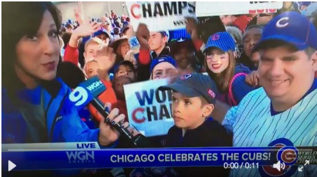
And an L disguised as a W: