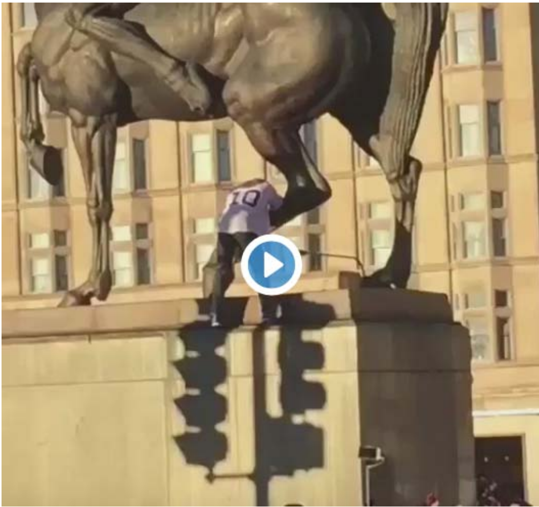
A nice Midwestern dad terrifies his son with his scream: