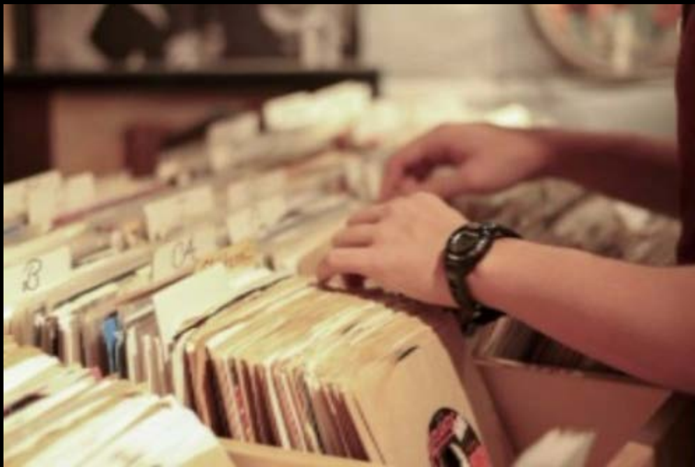
An MU student browses records at Hitt Records.

If you like records: Tomorrow is Record Store Day 2017, and the three record stores downtown, Vinyl Renaissance, Hitt Records and Slackers, are all participating. The event means lots of exclusive and newly released records will be available to purchase, and great sales can be expected. Just make sure you get out there early if there's a particular exclusive you want to buy, as they may sell out