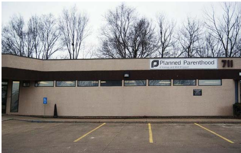
Planned Parenthood in Columbia