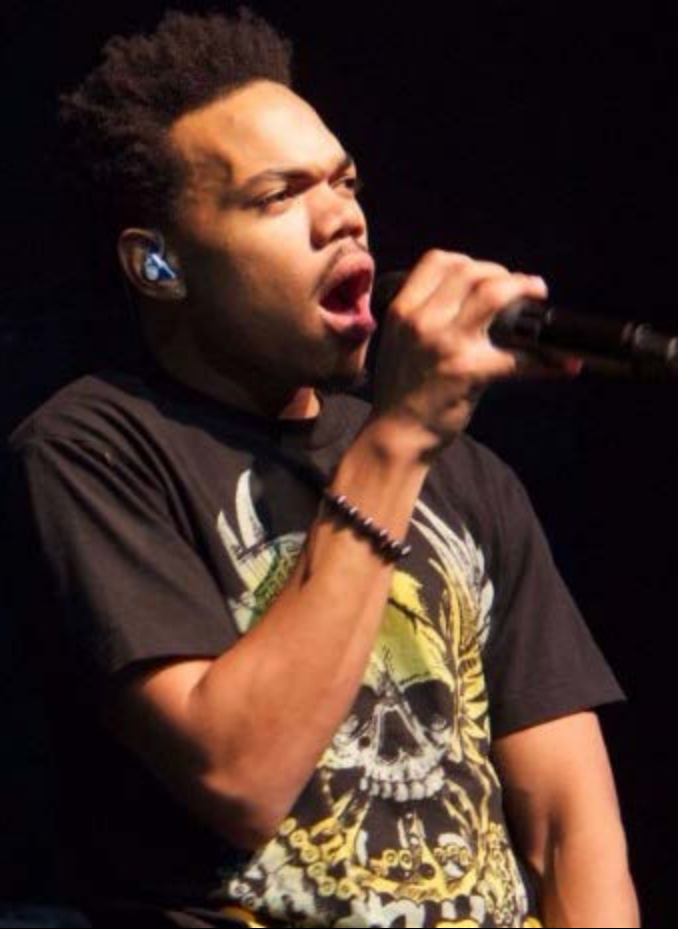
Chance the Rapper performing.

In celebrity lives: Time released its list of this year's most influential people. Names include Julian Assange, Donald Trump, Chance the Rapper and Ashley Graham. The public figures are nominated based on their influence and contributions and are divided into categories, such as Pioneers, Artists, Leaders, Titans and Icons. Time's announcement said "the list includes active opponents" and several people "whose influence is the subject of heated debate." Additionally, "each has champions and critics" and "all are shaping the course of this turbulent year."