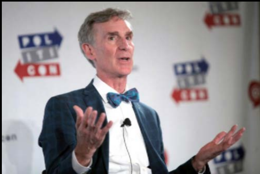
Bill Nye speaking at Politicon in 2016.