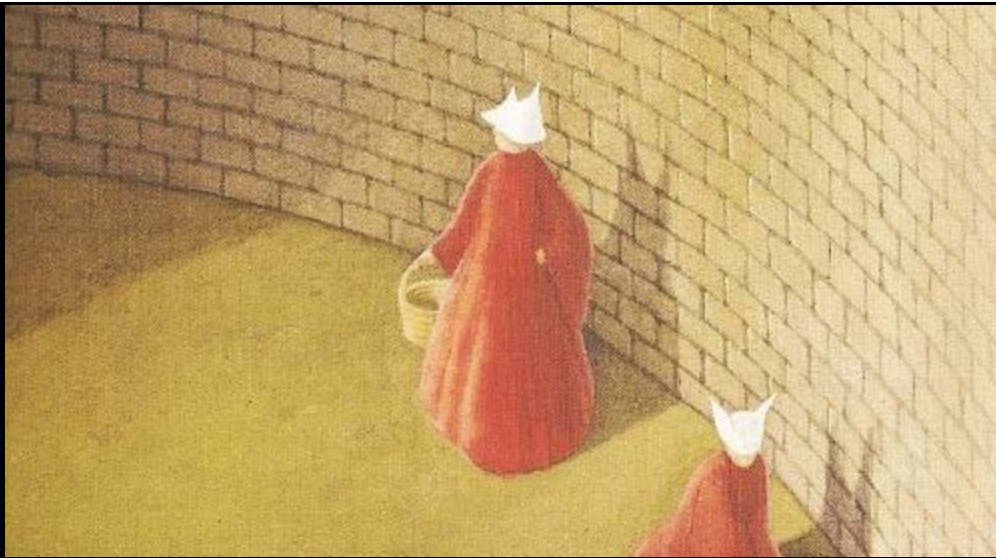
Cover art from The Handmaid's Tale.

If you like Margaret Atwood: “The Handmaid’s Tale,” a new show based on the novel by Margaret Atwood, premiered on Wednesday. The show depicts a dystopian society in which women are forced to reproduce with men of higher statuses. The show is being released on Hulu, three episodes at a time.