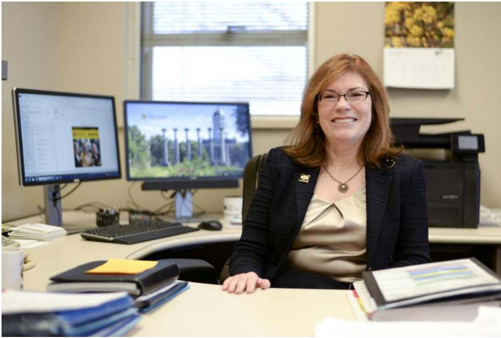
Interim Chancellor Garnett Stokes