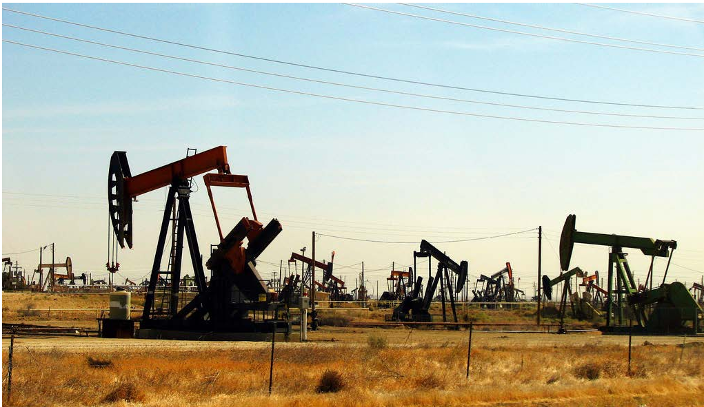
Oil pumps.