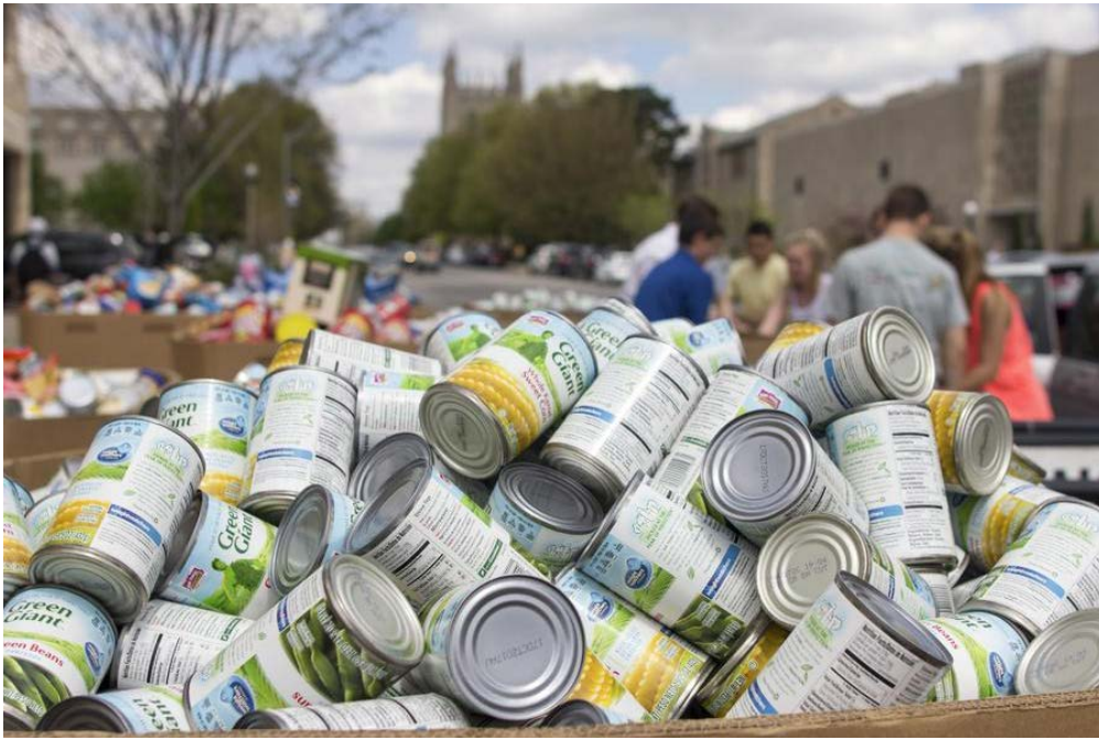
Maneater file photo.