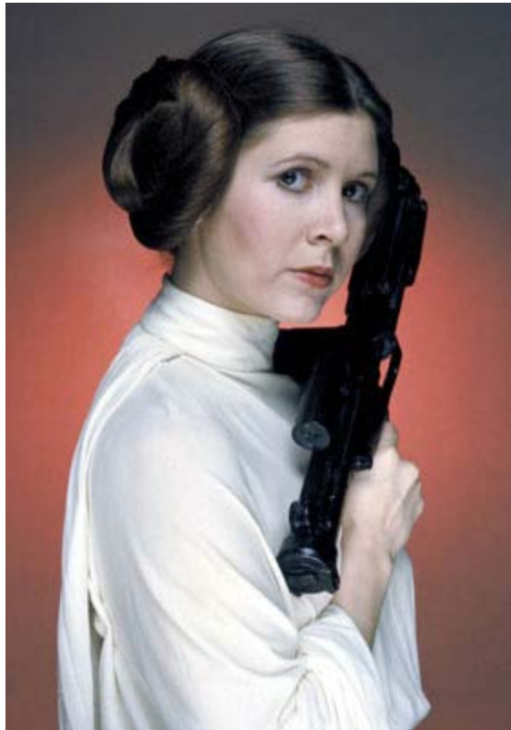
Carrie Fisher.