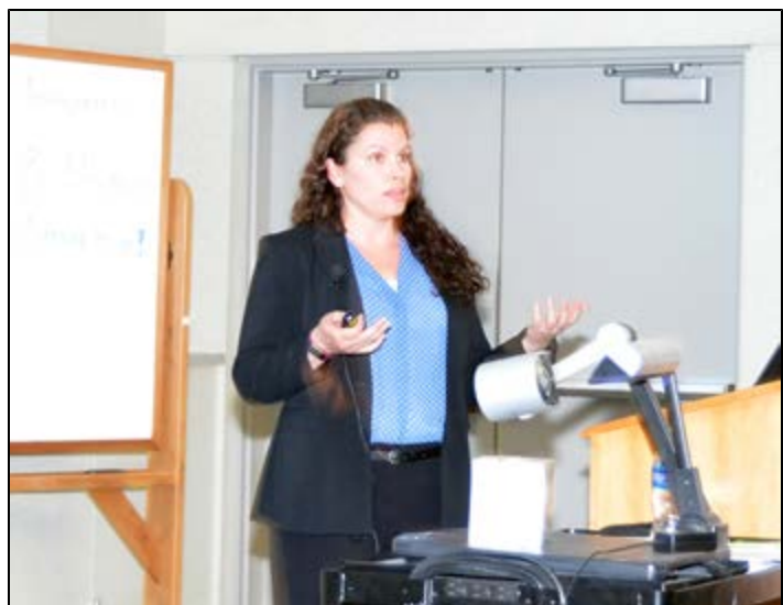
Emily Pieracci, DVM, of the Centers for Disease Control presented the keynote lecture during the CVM Research Day.