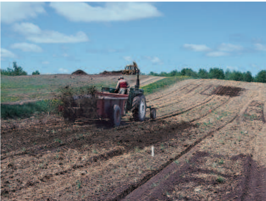
Applying compost, depicted in this SARE-funded project evaluating organic soil amendments to Maine potato fields, builds a healthier plant through healthier soil — and may suppress soil-borne diseases.

weed seed predators removed more than double the number of seeds from the no-till system compared to an adjacent conventional tillage system.