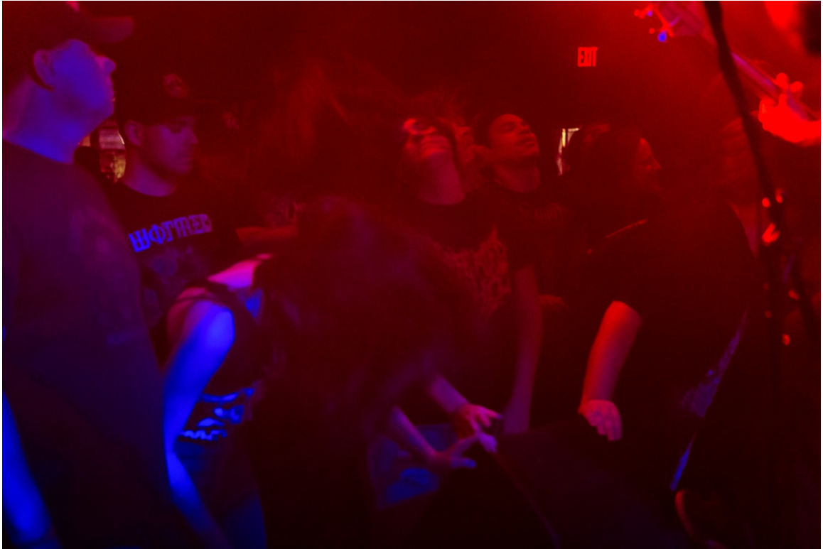
Fans head bang during Troglodyte's performance at the Riot Room.