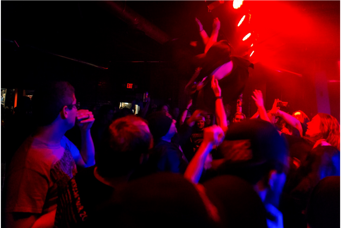
A fan swings from a crossbeam in the ceiling of the riot room during Troglodyte's performance at the Riot Room. The man fell to the floor shortly after, but jumped up immediately.