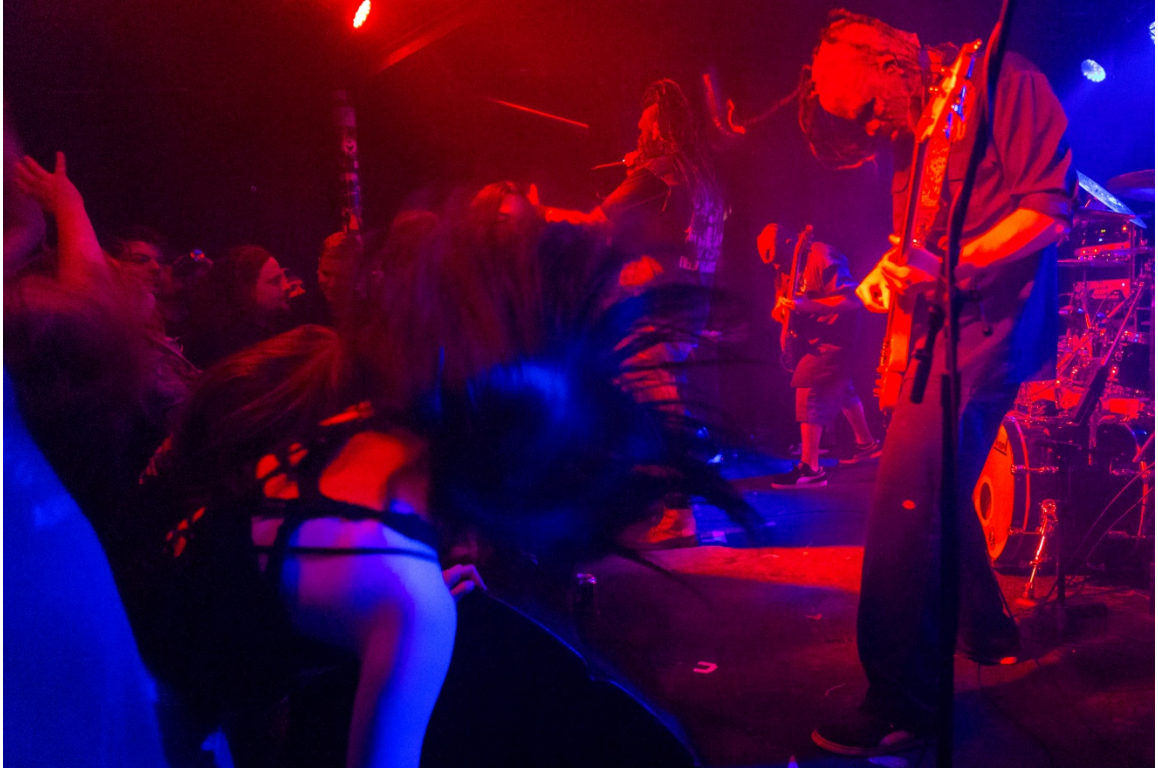
Fans swing their hair while Troglodyte performs at the Riot Room in Kansas City.