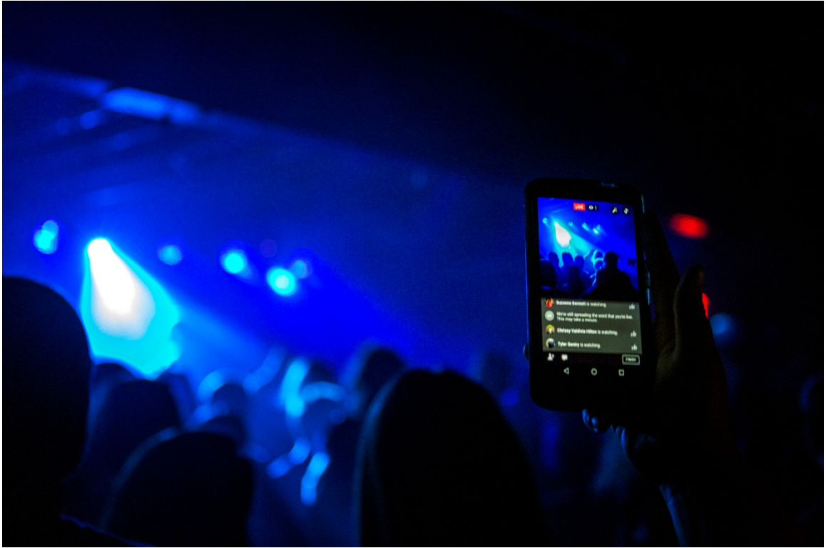
A fan live streams Unmerciful's performance via Facebook Live at the Riot Room.