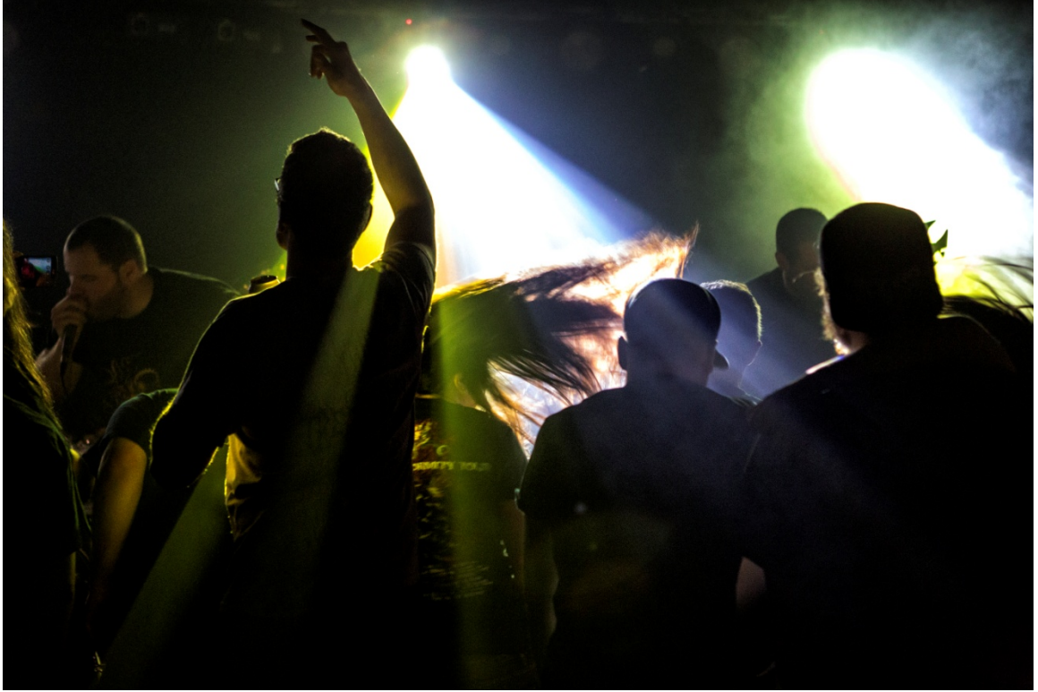
Stage lights silhouette fans during Unmerciful's performance at the Riot Room.