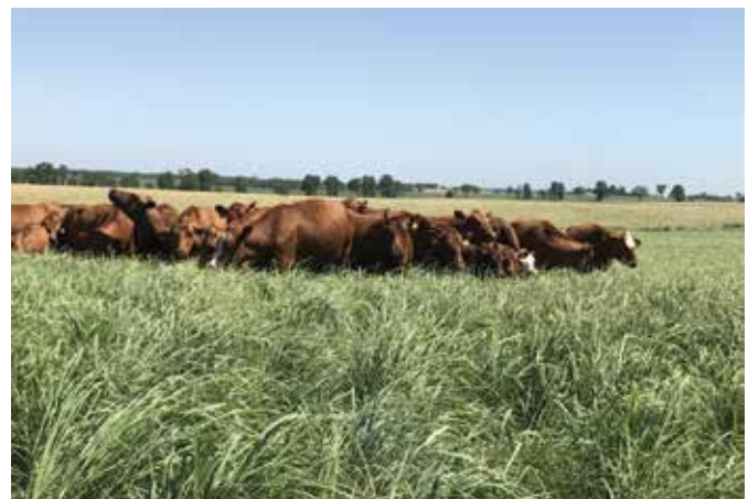
Figure 4. Stands of native warm-season grasses, forbs and legumes can be used for hay or grazing, providing a summer forage for livestock.

Mixed stands of native warm-season grasses, which include forbs and legumes, provide food and cover required by wildlife such as grassland birds, bobwhite quail and cottontail rabbits. Diverse stands also provide excellent habitats for pollinators such as butterflies, bees and other insects (Figure 1). A selection of native forbs and legumes that can be established with native warm-season grasses can be found in Table 1. MU Extension publication G9422, Integrating Practices That Benefit Wildlife With Crops Grown for Biomass in Missouri , also provides more information on seeding rates for native grasses and forbs in Table 2.