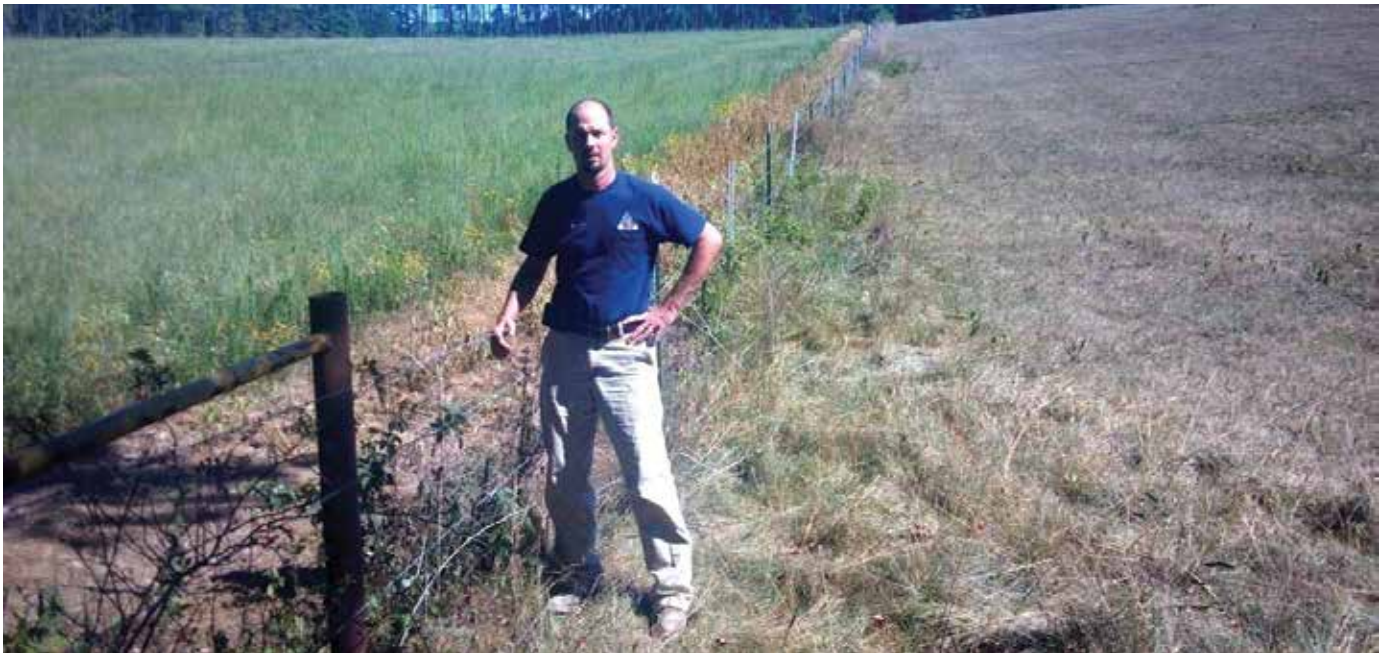
Figure 3. The stand of native warm-season grasses and forbs on the left is more likely to survive drought conditions and still produce forage. The field of tall fescue on the right is dormant and does not provide grazing or hay crops during prolonged periods of dry conditions in the summer.