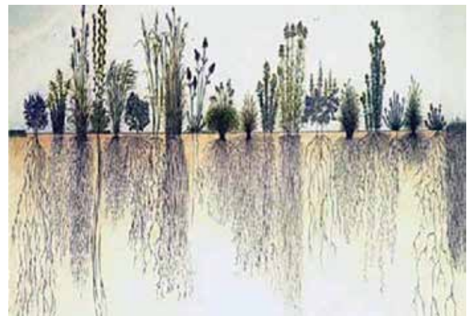
Figure 2. Native grass, forb and legume mixtures help maintain soil health, improve soil organic matter and prevent nutrients from infiltrating adjacent streams. Note the soil depth comparison of the root system of Kentucky bluegrass on the far left with the root systems of a variety of native forbs and warm-season grasses.