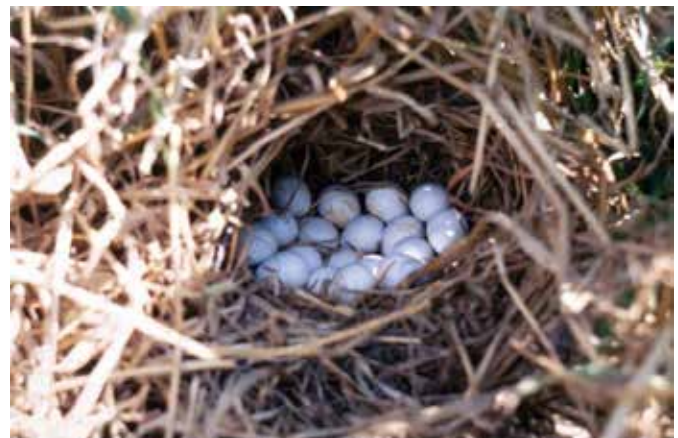
Figure 5. Bobwhite quail nesting activity begins in late April and can continue through July. Peak hatching of the first clutch of eggs will usually occur in mid-June.

For most wildlife, including grassland songbirds, grazing these mixtures at light to moderate stocking rates during the growing season (late spring and early summer) is often preferable to high-intensity, short-rotation grazing. This grazing strategy also benefits bobwhite quail because it creates an open structure at ground level, which facilitates wildlife movement and feeding and maintains a canopy of overhead cover. This open ground structure also benefits