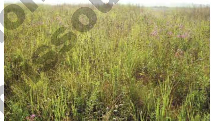
Figure 1. Forbs and legumes can be established with stands of native warm-season grasses to improve their value for wildlife and pollinator habitat.

Fields with diverse vegetation typically attract a greater variety of wildlife than monoculture, or single species,