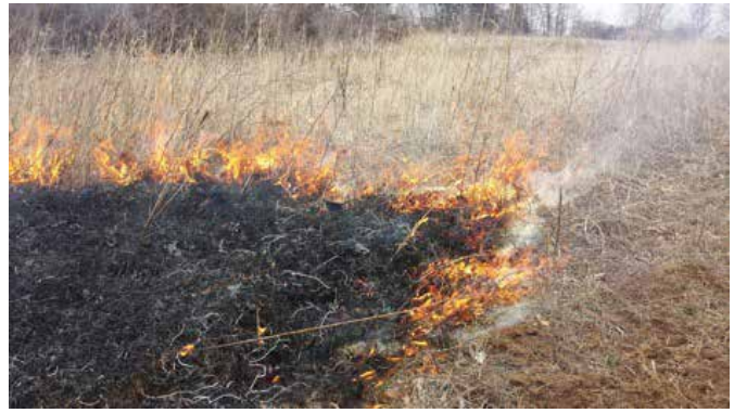
Figure 6. Periodic prescribed fires benefit forage production and wildlife.

Stands of native warm-season grasses and forbs need periodic prescribed fires as shown to maintain optimum conditions for forage production, as well as to provide benefits for wildlife (Figure 6). Conducting a prescribed burn is an excellent management tool for increasing plant diversity and improving the forb component of a stand of grass. Fire removes accumulated dead plant litter and creates more open conditions at ground level that