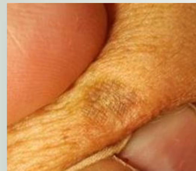
d. Dimple Sign

One NP will be the facilitator to train 10 NPs in the surrounding community.