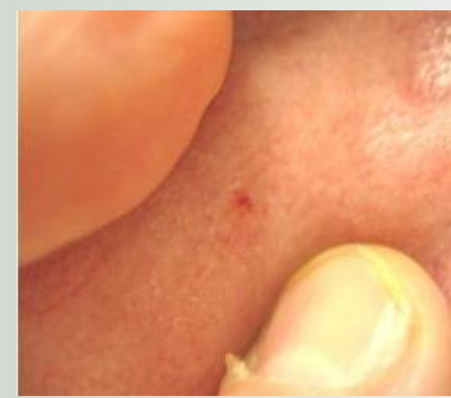
b. BCC Post Stretch (whitening)