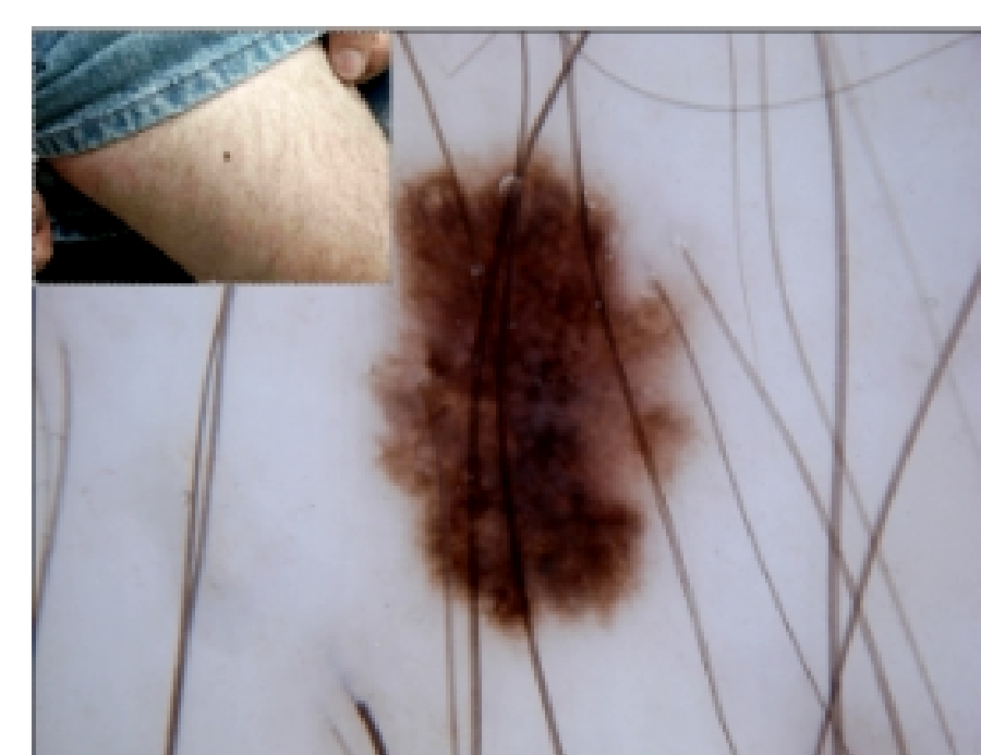
This patient was unaware of the growing 5mm near melanoma on the left thigh. We can detect three worrisome features: atypical network, border variation, and gray area.