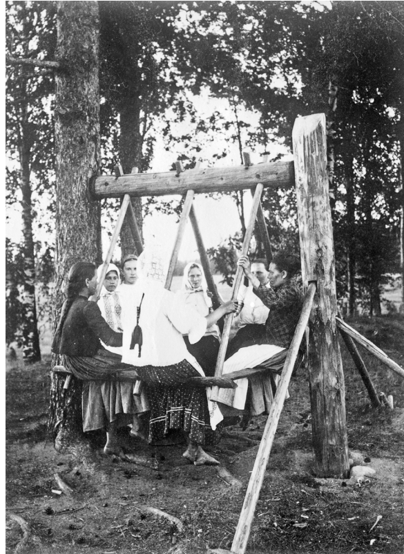
Photo 2: The girls of Risumäki village posing still by the swing for the collector A. O. Väisänen in 1914 (Museovirasto 128:11).

The particular West Ingrian melody-type of swinging songs consisted of four beats, a narrow scale (3-4 tones), and a melody with an up and down character. This type of melody proceeded line-by-line and had neither refrains nor partial repetitions. The way in which these songs were sung was that the lead singer would sing a verse and the chorus would then repeat it. The melody might vary to some degree during the performance, and thus contain some heterophony in choral parts. Moreover, the singers might sometimes add rhythmic syllables in unstressed metrical positions. This same melody-type with similar textual themes of swinging