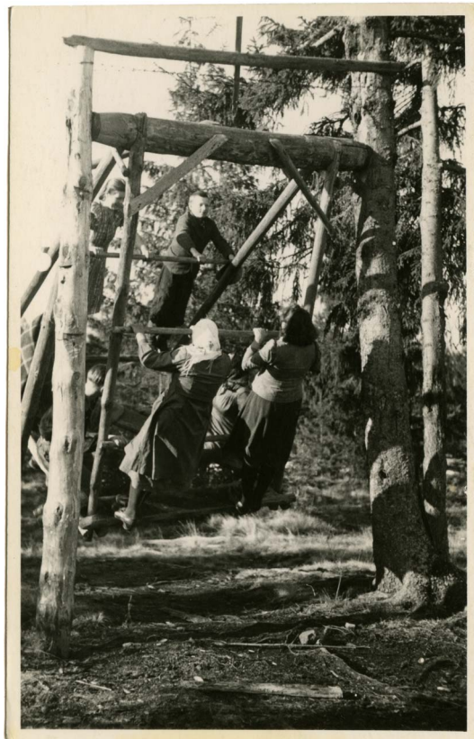
Photo 1: Swinging in the Kallivieri village during the Second World War in 1943.

Easter was the occasion that brought the entire village to gather around the swing. Many singers associated swinging songs explicitly with this context. According to Salminen (1929:63), on Easter everyone, even the older men, would take part in singing by the swing, and people would travel long distances to the Soikkola villages. Dancing