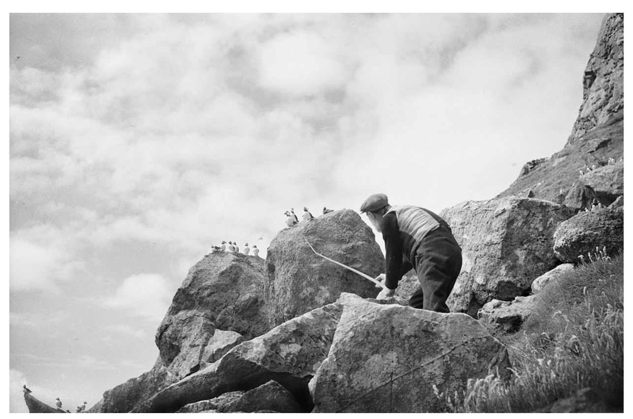
Image 4. Finlay MacQueen snaring puffins, Carn Mor, St Kilda. Photo by Robert Atkinson, 1938 (School of Scottish Studies Archives).

formed the main part of the diet and subsistence on the island, and they also provided a means of barter and, later, cash. Fulmar were harvested in August and the feathers were sold to pay the rent to the landlords, for many centuries the MacLeods. Their oil was used as fuel for the crusie lamps and to lubricate the wool for spinning and weaving the famous St Kilda tweed. Only Hirte was populated, but fowling trips were made to nearby Boreray, Stac Lì, and Stac an Armainn, the huge guano-covered rocks rising almost vertically out of the ocean.