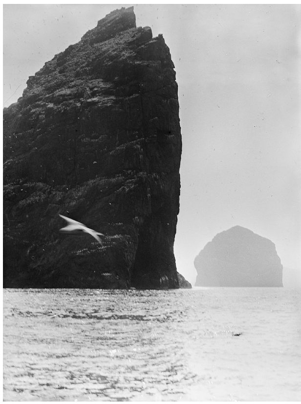
Image 5. St Kilda: Stac an Armainn.