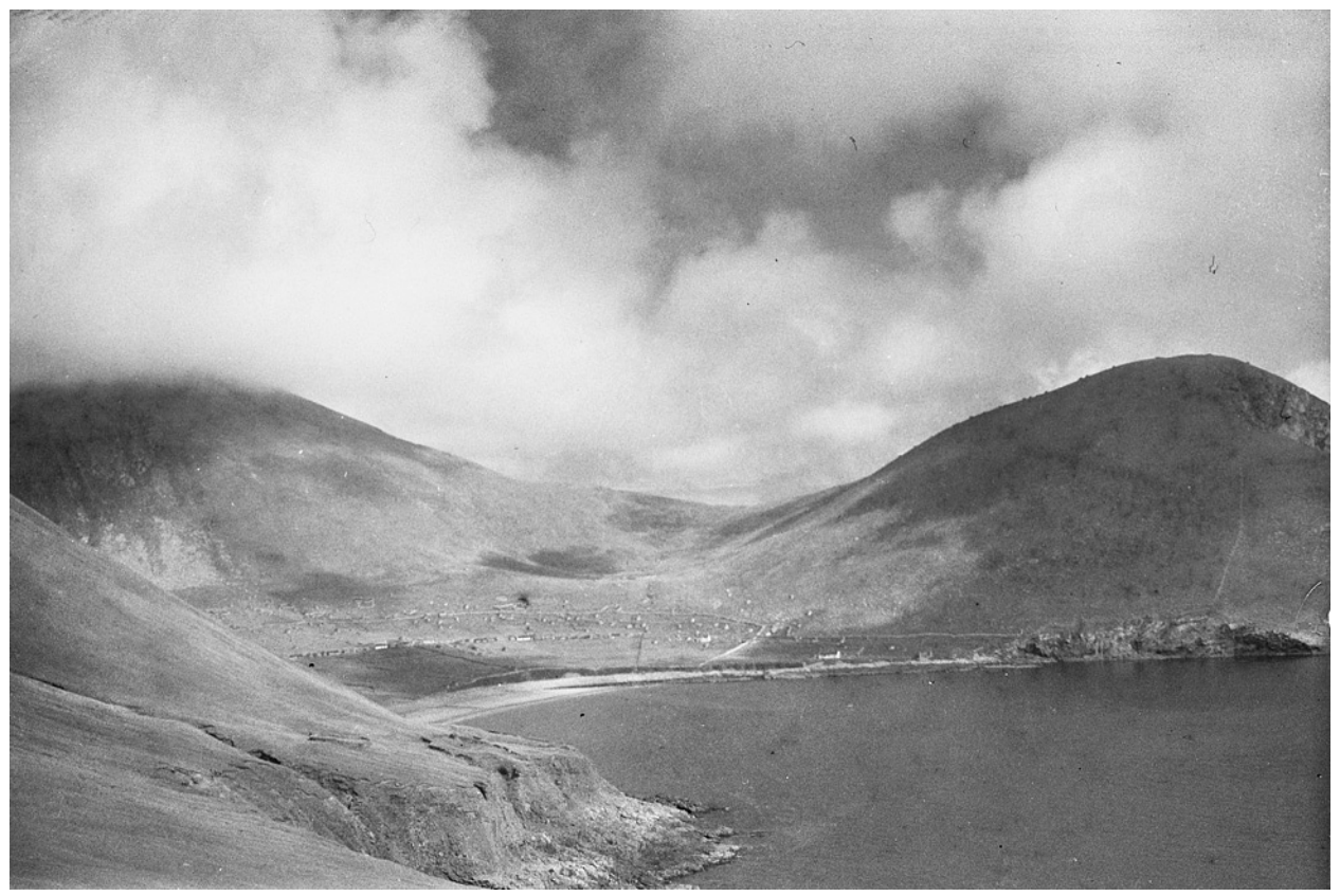
Image 3: St Kilda. Village Bay, Oiseabhal and Conachair. Photo by Robert Atkinson, 1938 (School of Scottish Studies Archives).

As an example of the kinds of material available on the website, I include a taster from St Kilda, a small archipelago located around forty miles off the Western Isles of Scotland.<sup>4</sup> 2010 marked the eightieth anniversary of its evacuation, undertaken at the request of its people, numbering only 36 by 1930, a population by then so small that there were not enough young, able-bodied men to sustain it. Various factors contributed to its decline, including a series of illnesses and accidents and the government's refusal to provide either a health or transport infrastructure despite being able to do so during the First World War, when there was a naval station on the island. Contact with servicemen had also enabled young people to find out more about life elsewhere and encouraged emigration.