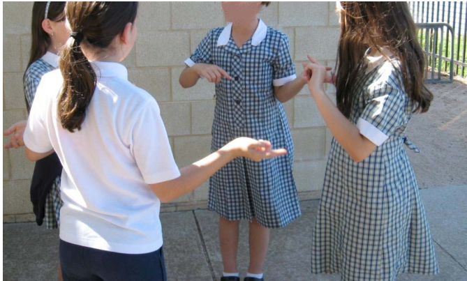
Fig. 3. Playing a clapping game “Miss Moo.”

By browsing the lists of schools and the play recorded at each location, it is possible to gain a sense of which games are ubiquitous, which regional variants were recorded, and the gender and age of the participating children in particular games. For instance, upon selecting School 01 the user might be interested in a clapping game called “My Boyfriend Gave Me an Apple” ( http://ctac.esrc.unimelb.edu.au/biogs/E000096b.htm ). Selecting that link will lead to information about six different variations of this clapping rhyme, played at six different schools across Australia. Notably, the New South Wales version is the only one that refers to a recognizable local landmark, the Sydney Harbour Bridge.