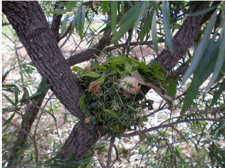
Fig. 4. A Fairy Cough.

Over the last two decades, a new category of play activities has emerged as schools increasingly employ information technology in their pedagogical practices and a growing proportion of students have access to computers outside school, particularly in the home. In a minority of schools visited, students in the upper primary years had individual laptops or tablet devices, although this is not commonplace in Australian primary schools. Some schools