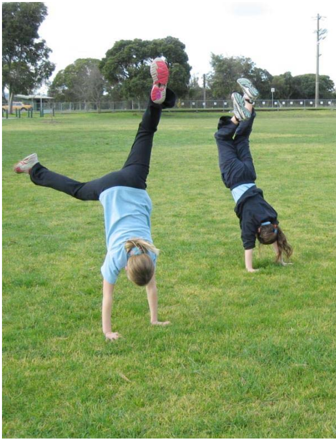
Fig. 2. A game called “The Greatest” that involves a lot of physical challenges.

One of the implications of a regulatory framework for research with children was that fieldworkers could not record interviews, capture video, or take photographs without the written consent of parents (and in one state, of the children)—although they could observe and take written notes of children’s activities in the playground. Children who were identified by the fieldworkers to be playing in interesting and creative ways, and who had parental consent, were then interviewed in a semi-structured format and also filmed while talking about their play and demonstrating various games and verbal lore.