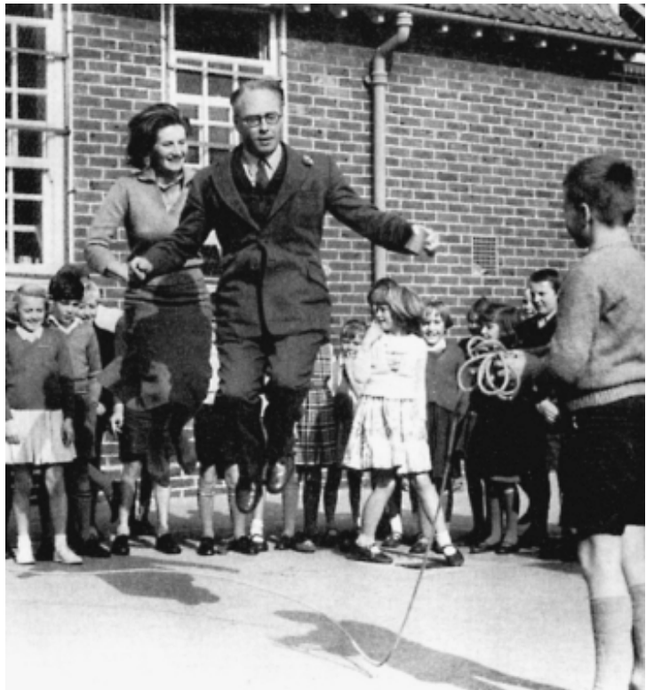
Fig. 1. Iona and Peter Opie skipping.

The Opies undertook extensive fieldwork—including surveys, tape-recorded interviews, and observation—as well as literary and historical research to inform their books concerning the folklore of school-aged children. They also corresponded with a host of individuals, including teachers, children, members of the public, fellow researchers, journalists, broadcasters, and publishers. The materials they amassed form an archival collection that is now distributed among the Bodleian Libraries (University of Oxford), the