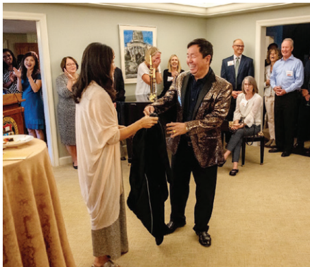
A sequined surprise! The Magic Jacket