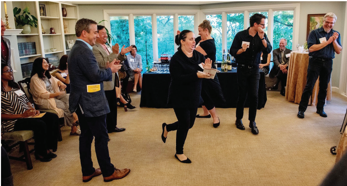
The Stable Boys (and girls!) kept the crowd laughing.