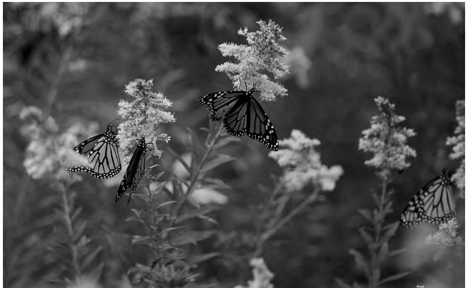
Figure 8. Monarch butterflies.

Milkweed butterflies belong to the subfamily Danainae, in the family Nymphalidae. Historically, this group had been considered a separate family, Danaidae. These butterflies get their name from feeding on milkweed plants. The caterpillars are apparently immune to the toxic juice of the milkweed and consume it voraciously. Thus, both the caterpillars and adults are distasteful to predators such as birds. The monarch butterfly is the most common and familiar milkweed butterfly and is easily recognizable by its bold orange and black color (Figure 8). (The viceroy, a brushfooted butterfly, resembles the monarch but is smaller and has a black line across the hindwing. Male monarchs have an enlarged, dark spot in the middle of each hindwing that give off a scent to attract females.