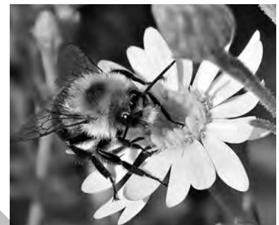
Figure 1. Bumble bee ( Bombus spp.).