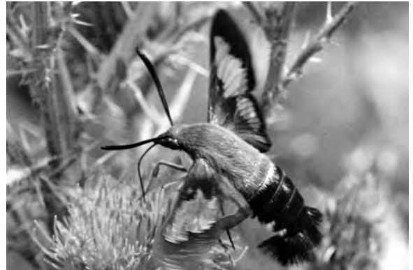
Figure 9. Snowberry clearwing.

Owlet, dagger or underwing moths are of the huge family Noctuidae, which numbers more than 20,000 species worldwide and more than 700 in Missouri (Figure 11). It is by far the largest family of the Lepidoptera in the state. Most noctuids are medium-sized (0.75 to 1.75 inches) and somber gray or dull brown, with a few exceptions of bright color (for example, green marvel, beautiful wood-nymph and grape epimenis). The colors and patterns of