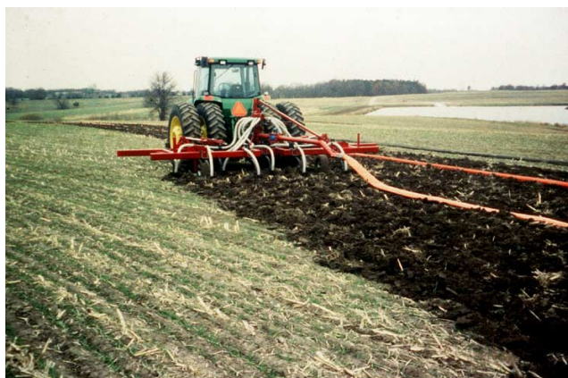
Figure 1. This hose-fed machine practically eliminates the odor from land application of liquid manure by injecting the manure into the soil.

Table 1 shows the buffer distances (the minimum distance between the nearest confinement building or lagoon and any public building or occupied residence) required by the Missouri Department of Natural Resources (MDNR).