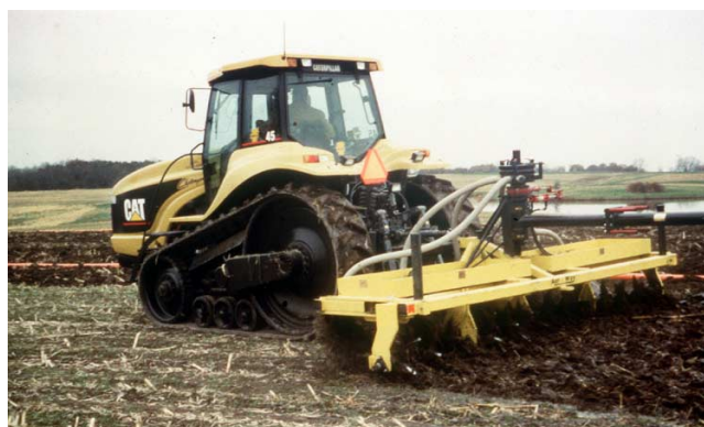
Figure 3. Liquid manure pumped from a manure storage facility is incorporated into the soil by rotating tines. This method reduces odors associated with surface application of manure.

vaporization than high-pressure and high-trajectory application. In-canopy sprinklers for center-pivot irrigators should be considered for odor reduction.