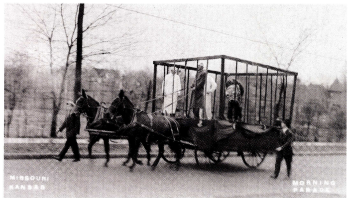
1913 The parade has been a Homecoming tradition for more than a century. After this 1913 parade, Mizzou played Kansas.

On average, about 30,000 people line the streets of downtown CoMo to watch the parade. The largest crowd occurred in 2012 when ESPN's College GameDay broadcast from the Quad. That year, the crowd was estimated at 50,000. M