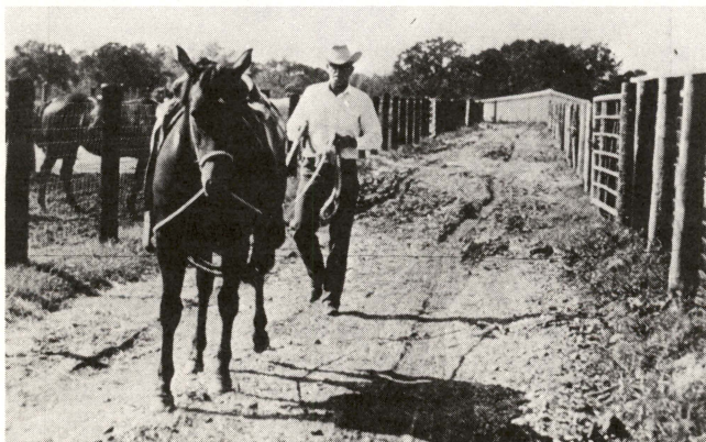
Figure 3. Ground driving gentles the young horse and teaches him obedience.

The horse should learn to stop, back and respond laterally. The yearling can be taught to respond to nose pressure and to use both leads while working in a circle without a rider. The primary objective should be to get a response on loose reins with a minimum of pressure. Never give prolonged steady pulls on the hackamore. Steady pressure ceases to have meaning to the horse. By the time the horse is ready to ride, he should have good respect for the bosal and nose pressures and know how to make some of the simple responses.