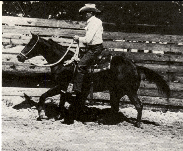
Figure 5. Rider is helping horse find leads in a round pen. At an extended trot, rider has weight on inside stirrup. Hands should pull nose to inside.

Usually one lead is natural for the horse and the other must be learned. Less work will be required on the natural lead than on the learned lead. In the initial stages, the horse should be worked several trials on the learned lead before coming back to the natural lead. As the horse becomes more accustomed to leads, he begins to trot less distance each time before breaking into the lope. The lead becomes easier to pick up and the horse requires less assistance each trial.