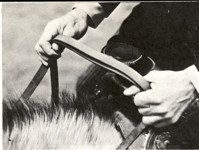
Figure 4. Good hand position for schooling a horse, a rein in each hand.

a pull, the reins should be released. Training for the neck rein will require the use of both the direct and the bearing rein in the early stages. A direct rein is used to show the horse the direction in which to move. This rein is also used to keep the horse's head turned slightly to the inside when working in a circle.